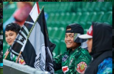
Young Warriors fans