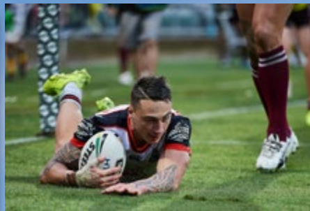
Charnze Nicoll-Klokstad scores a try