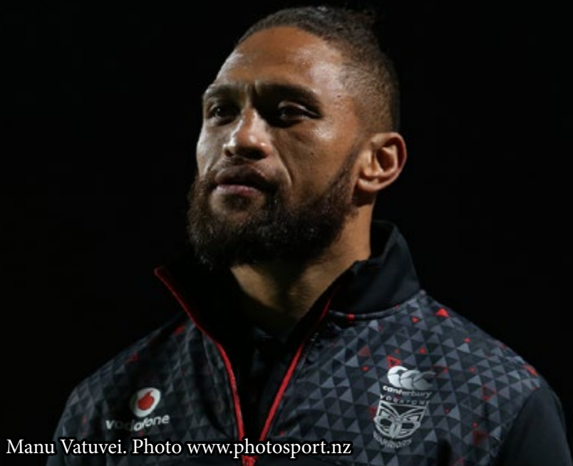
Manu Vatuvei.

A S SPORTS fans we like to make comparisons between players and particularly talented young players often get compared to being reminiscent of great players. A "young Hadlee, a young McCaw, a mini-Jonah." Most of the time the comparisons are unfair and unrealistic. Even long before his retirement we've seen many young players compared to Manu 'The Beast' Vatuvei but those of us that have loved watching him over the years know there can only even truly be one 'Beast'.