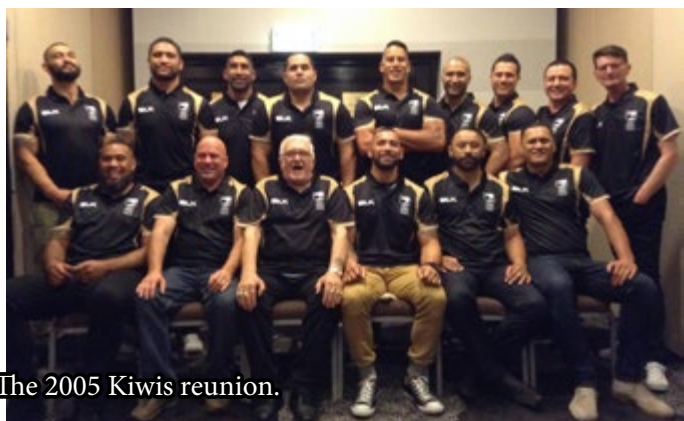
The 2005 Kiwis reunion.

Catch Manu on TV 1's Breakfast this Friday morning!