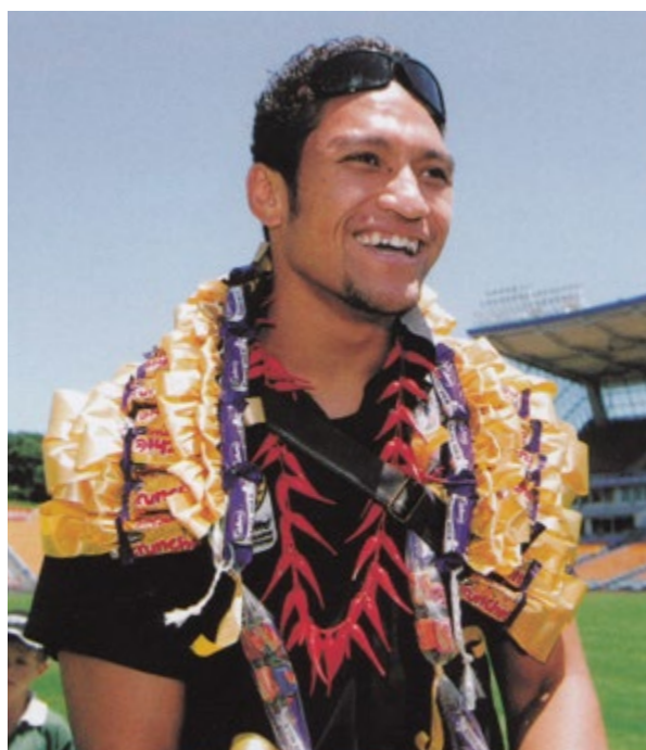
Manu Vatuvei at the Kiwis welcome home at Ericsson Stadium.