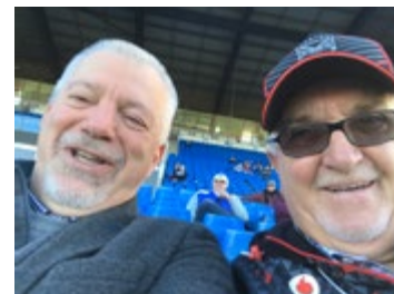
Watching The NYC team with this rugby league legend George Peponis.