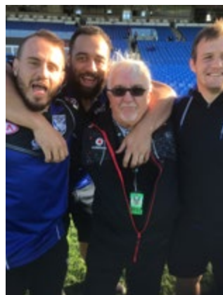
Was great to catch up with these guys on Saturday at the NYC game all good guys.