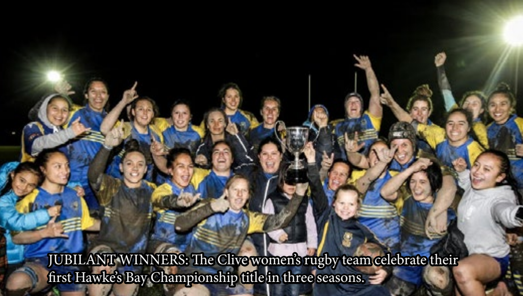
JUBILANT WINNERS: The Clive women's rugby team celebrate their first Hawke's Bay Championship title in three seasons.