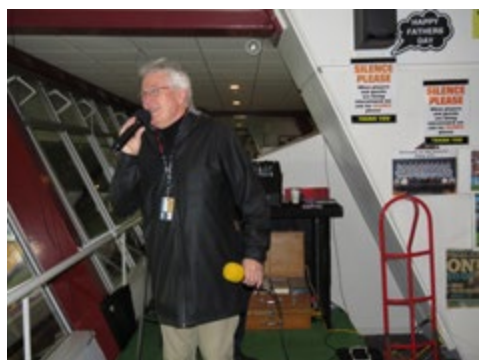
Mike Chunn living legend from Split Enz sings Islands in the Stream.