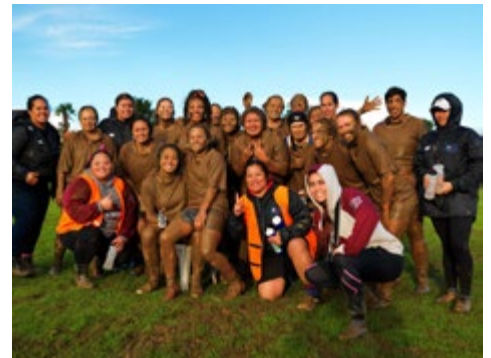
Richmond Roses all smiles after a victory over Manurewa at Cornwall Park.