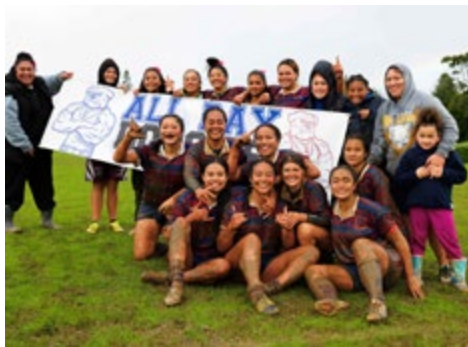
Richmond Girls Nines grade.