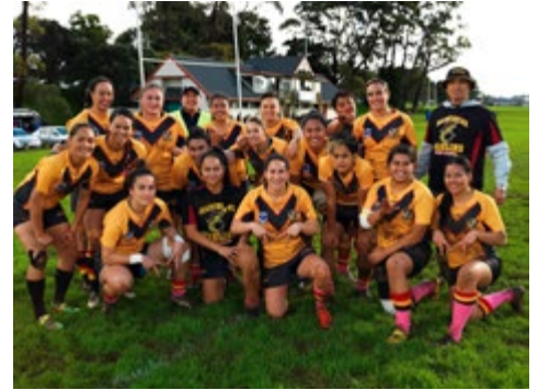
Manurewa Marlins Wahine.