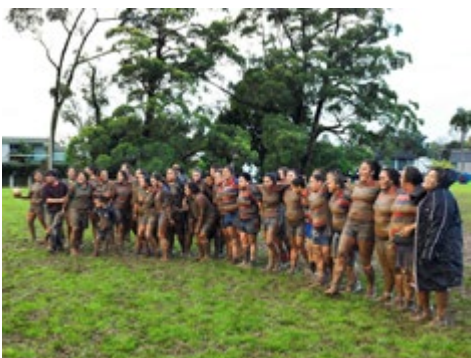
Te Atatu and Mangere East post match at Women in League Day.