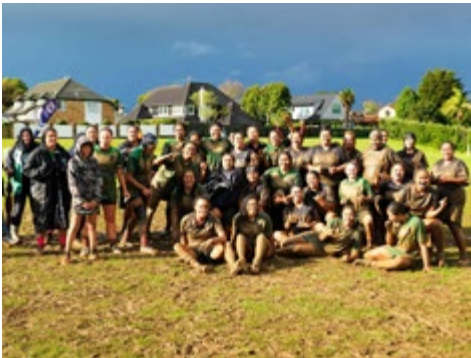
Pt Chevalier and Manukau Womens pennant post match at Women in League Day.