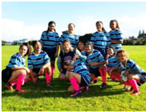
Otahuhu Girls under 15s Nines grade.