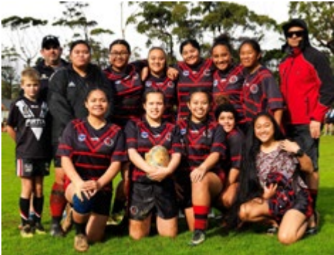
New Lynn Girls Nines grade.