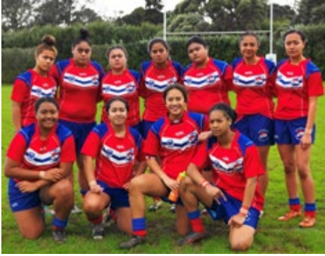
Girls Nines table leaders Otago.