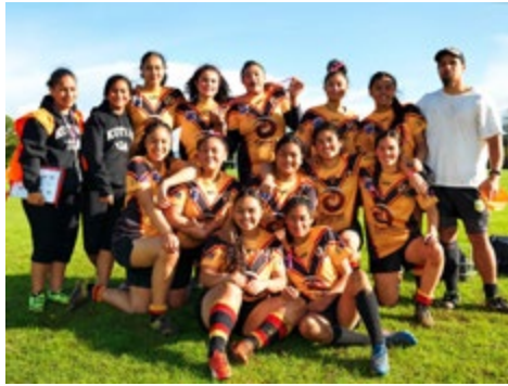
Manurewa Girls Nines grade.