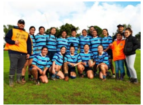
Otahuhu under 15s Girls Nines grade.