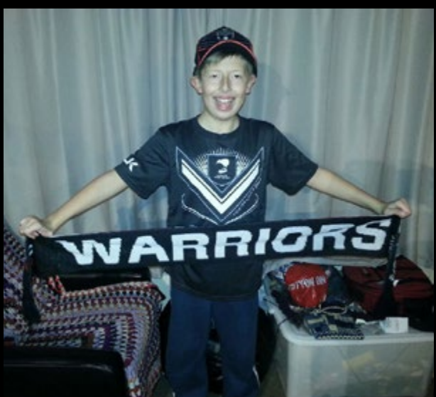
Kids around the country are loving these tshirts and looking forward to the RLWC 2017.

To Celebrate The Upcoming Rugby League World Cup We Are Giving Away 100 Kids T-Shirt Prize Packs Thanks To BLK! Each prize pack contains 2 t-shirts!