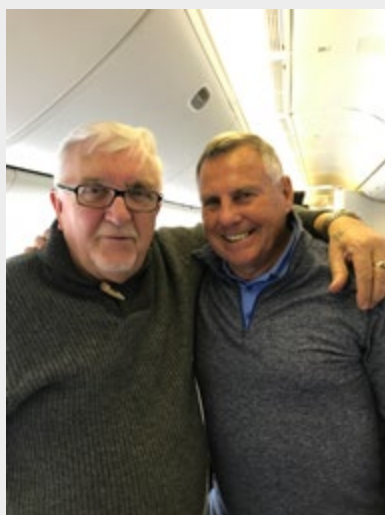
On my flight over to Sydney had the pleasure of the company a former All Black coach John Hart. He was director of football at the Warriors for awhile. Had a great chat to me on the plane and I was very impressed that you read the newsletter every week. Good on you John

This photo was taken on my plane ride over.