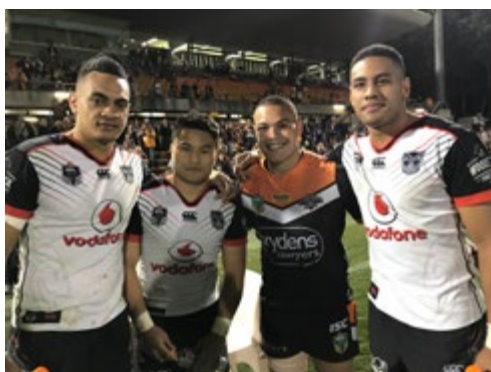
Ken Maumalo, Tui and David Fusitu'a.