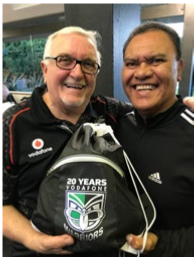
NZRL legend and former Mangere East Hawks player Olsen Filipaina played 77 games for West tigers, 8 for Eastern suburbs and 18 for North Sydney as well as 28 games for the Kiwis. He has a book coming out soon.