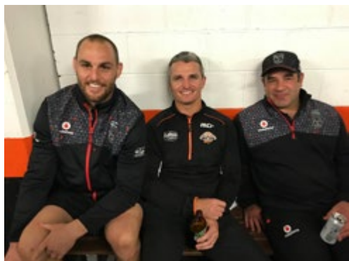
Simon Mannering, former warriors coach Ivan Cleary and club legend Stacey Jones.