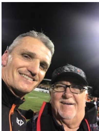
Great to catch up with Ivan Cleary former Warriors coach and good mate.