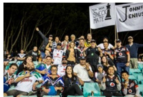
Loyal fans cheering on the boys!