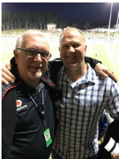
A Balmain legend Paul Sironen played 246 games for the Balmain Tigers and 21 games for Australia and 14 games for New South Wales in State of Origin.