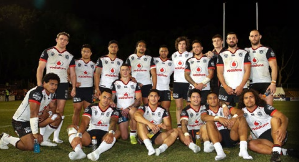
Vodafone Warriors after their final NRL game of the season.