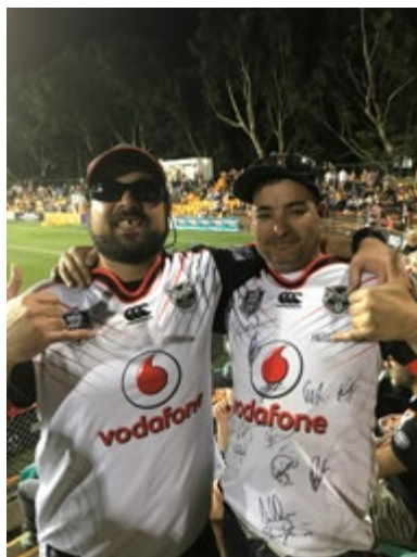
Two great Vodafone Warriors supporters who front up to every game in Sydney. The guy on the right drove an hour and half each way to the game. Now that's a real fan. He also cant wait for next year to become a member again.