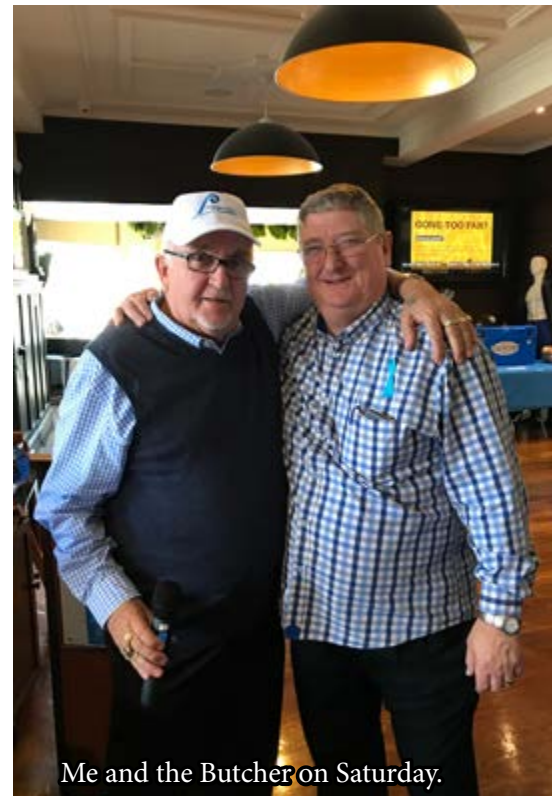
Me and the Butcher on Saturday.