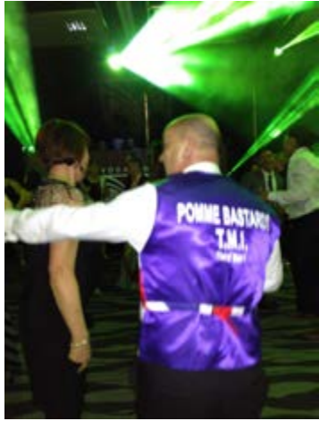
Guess Who it could be that pommie bastard lol.