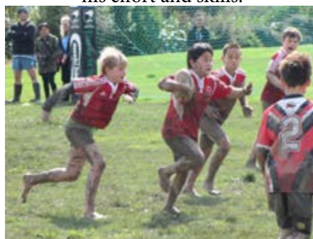
Richmond Warriors competing in the beginner grade with many playing league for the first time..