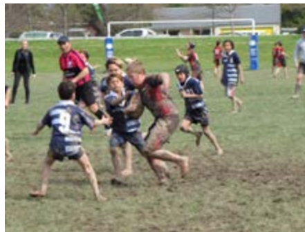
Playing tackle sport for the first time with mum taking time off work to come and watch. She couldn't believe his effort and skills.