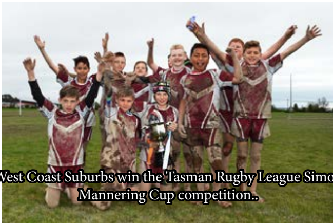
West Coast Suburbs win the Tasman Rugby League Simon Mannering Cup competition..