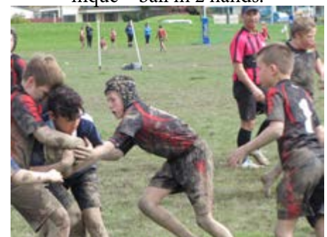
Team work and the joy of being physical and muddy – every 9 – 11 year olds dream.