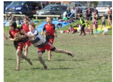
Richmond Shark player on the side line injured one minute, roaring off down the field with copybook technique – ball in 2 hands.