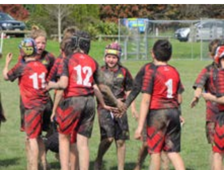
Richmond Tigers showing the inclusion of females playing. We had 2, one playing for the first time..