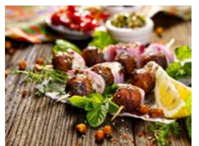
PREMIUM BEEF MINCE ONLY $8.99KG