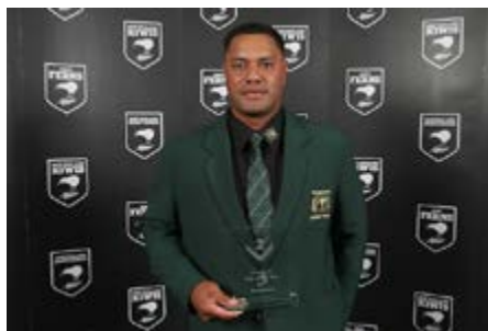
The Grassroots Club of the year award winners are Taniwharau (Huntly)