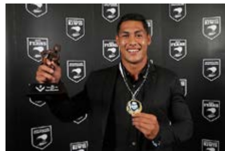
The Kiwis Player of the year award winner is Roger Tuivasa-Sheck (NZ Warriors)