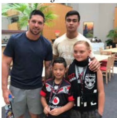
Very proud of how our players interact with our fans