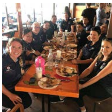
Just having lunch with the Harvey Norman Community Warriors after a very hard morning working with the local Rotorua Schools