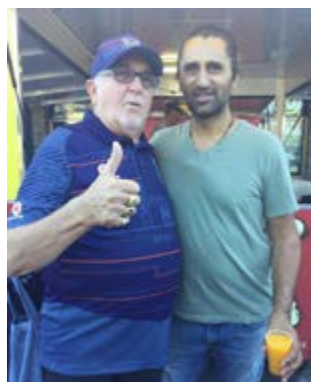
Just met Cliff Curtis a NZ movie star legend who is working on the new avatar movie, flies out tomorrow to Vegas bloody great guy