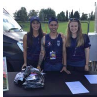
Great to have the membership team here at Rotorua