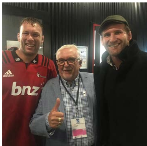
Good to catch up with All Black Wyatt Crockett and All Black captain Kieran Read. Two good buggers.