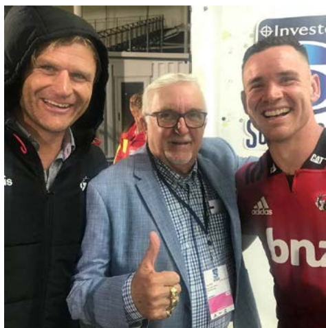
Had a great night with the Crusaders. Was great to catch up with former All Black Scott Robinson now the Crusaders coach and All Black Ryan Crotty.