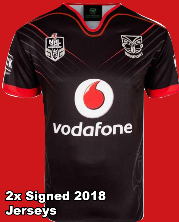
2x Signed 2018 Jerseys

To celebrate the Vodafone Warriors creating a club record and winning three games from three we are giving you the chance to win!