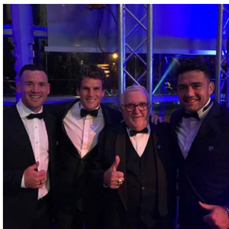
3 Crusaders and All Blacks. Codie Taylor, Ryan Crotty and Matt Todd.