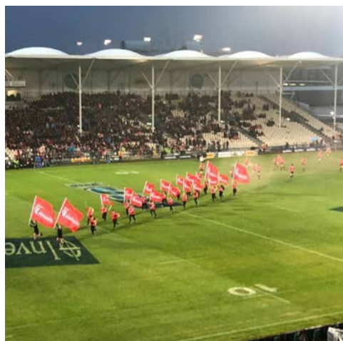
It's game time.

O N FRIDAY I was hosted by the Crusaders in Christchurch. To say I had a fantastic night would be an understatement. Here are some pictures from the night.