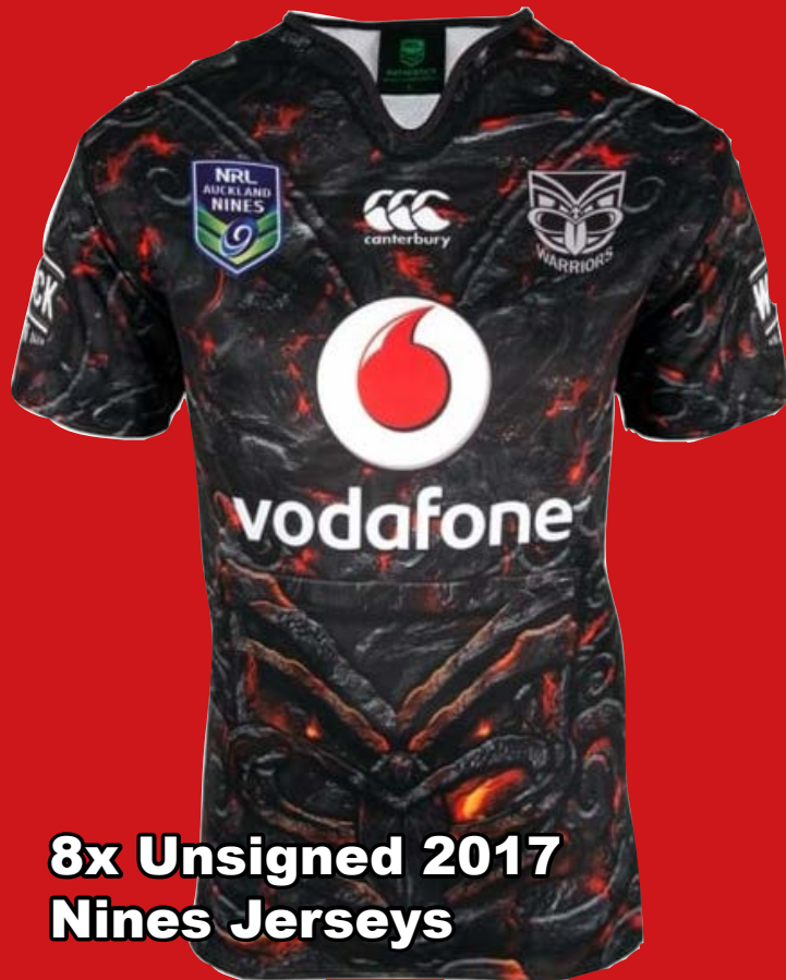
8x Unsigned 2017 Nines Jerseys