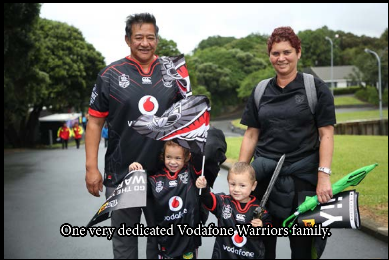
One very dedicated Vodafone Warriors family.