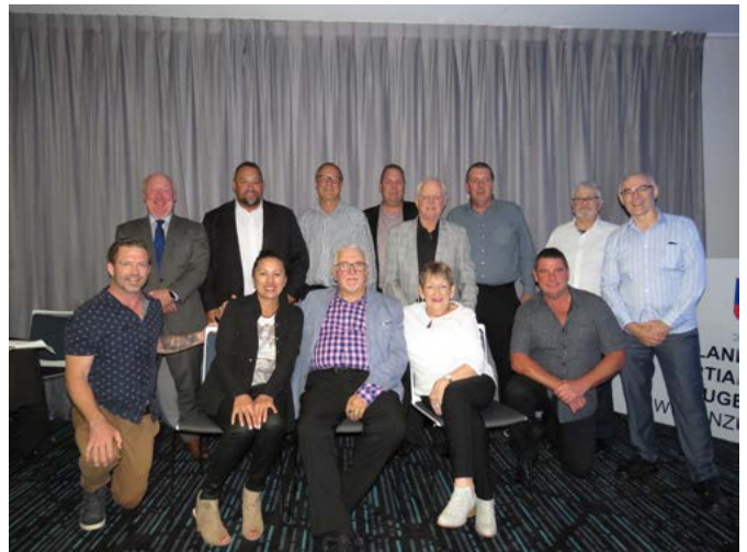
My table on the night.