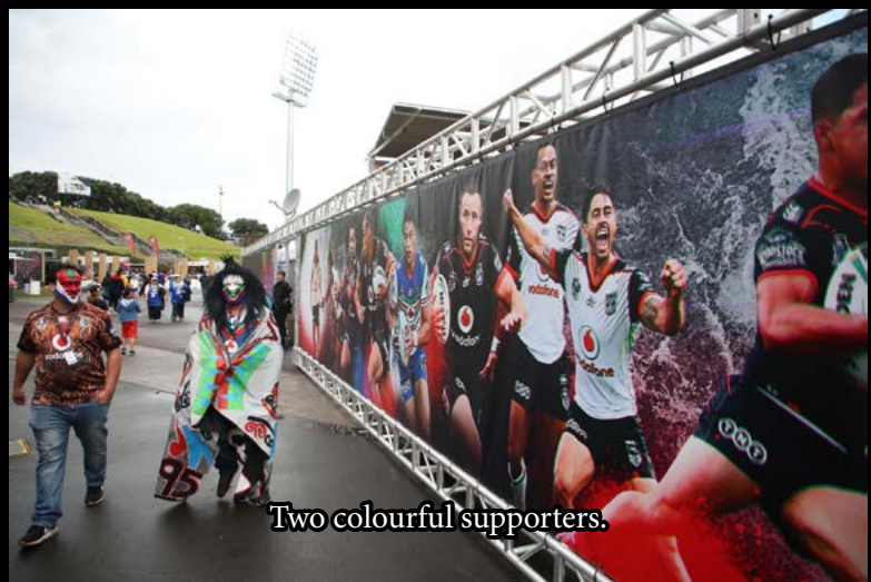
Two colourful supporters.