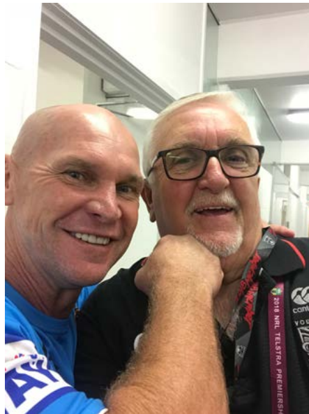
Rugby league legend Alfie Langer gives me an uppercut.