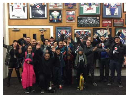
Dexter's tour of the stadium was a great hit again..