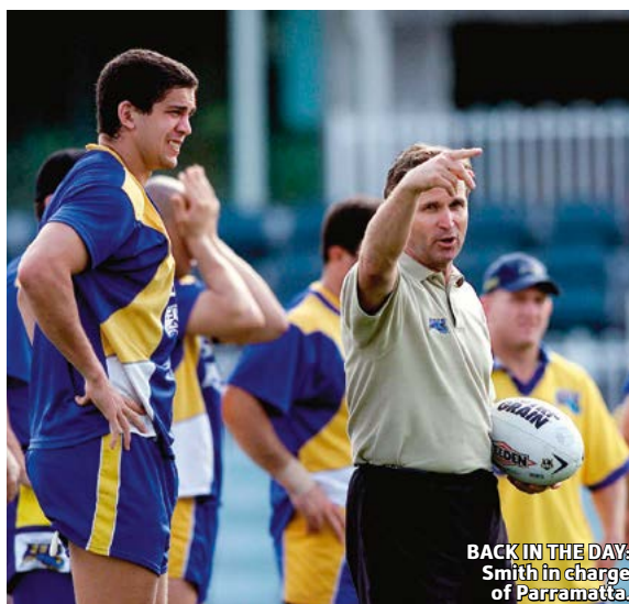
BACK IN THE DAY: Smith in charge of Parramatta.

One of only three coaches to top 600 career NRL games (Wayne Bennett and Tim Sheens are the others), he enjoyed success with Parramatta and St George. Smith also reached four grand finals and a Challenge Cup final, though never lifted the trophy.