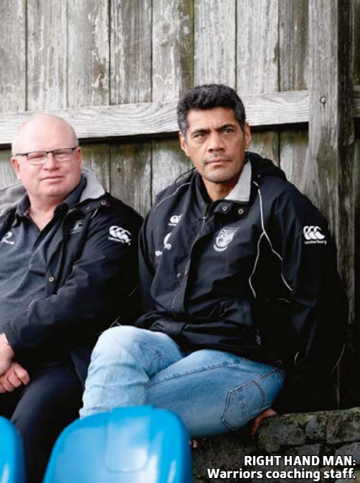
RIGHT HAND MAN: Warriors coaching staff.