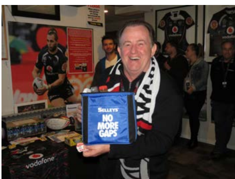
EDC wins the Selley's pack.