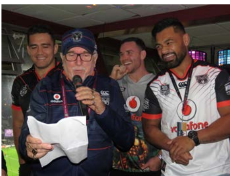
All Blacks Codie Taylor, Ryan Crotty and Jordan Taufua..