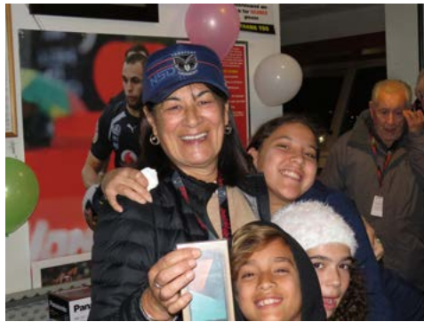
Miranda from up north wins the Vodafone cell phone.