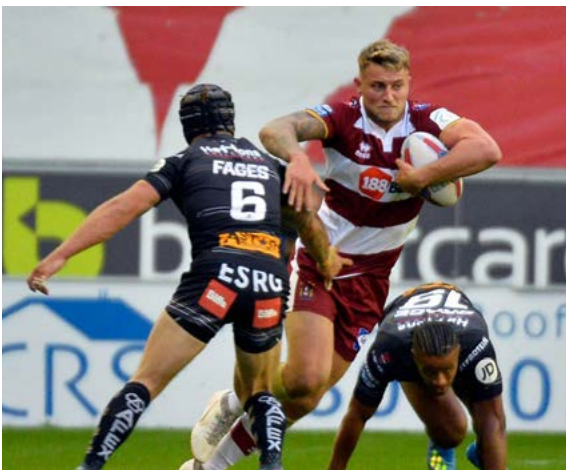
ACTION PIC v SAINTS.