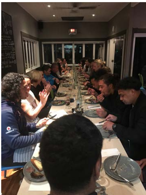
Everyone loved their meal.