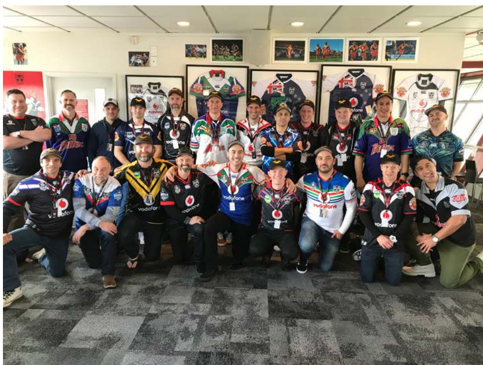
These guys all flew up from Wellington for the game.