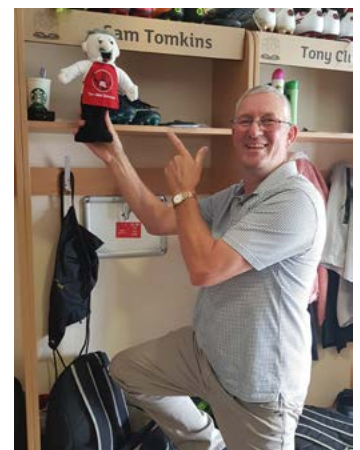
MAD BUTCH DOLL.