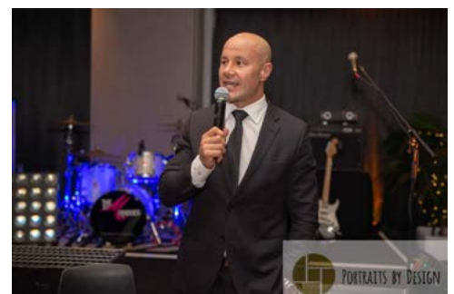
The man of the night thanking everyone for coming.