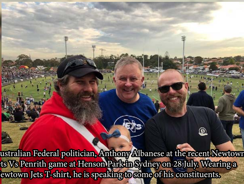
Australian Federal politician, Anthony Albanese at the recent Newtown Jets Vs Penrith game at Henson Park in Sydney on 28 July. Wearing a Newtown Jets T-shirt, he is speaking to some of his constituents.