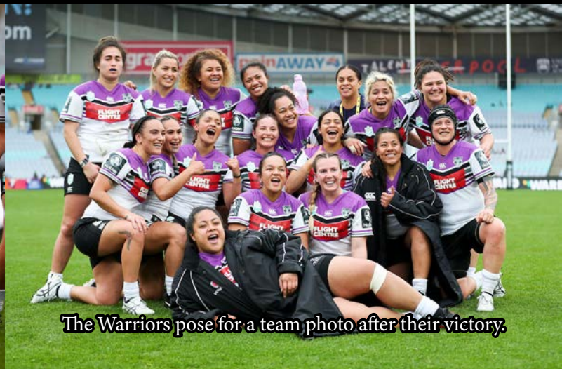
The Warriors pose for a team photo after their victory.