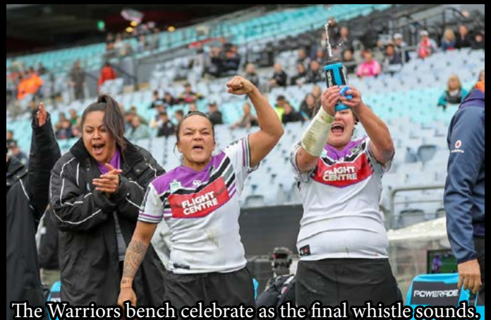
The Warriors bench celebrate as the final whistle sounds.