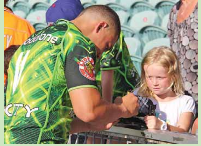
The lads were flat out signing autographs for adoring young fans!