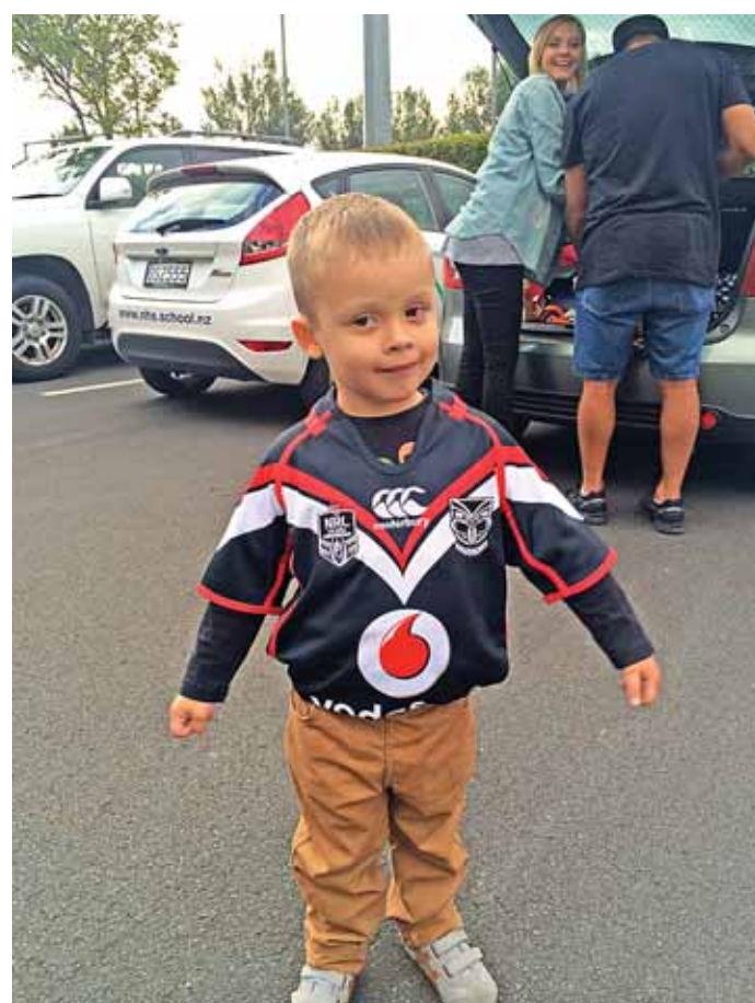
Love to see the little fans!