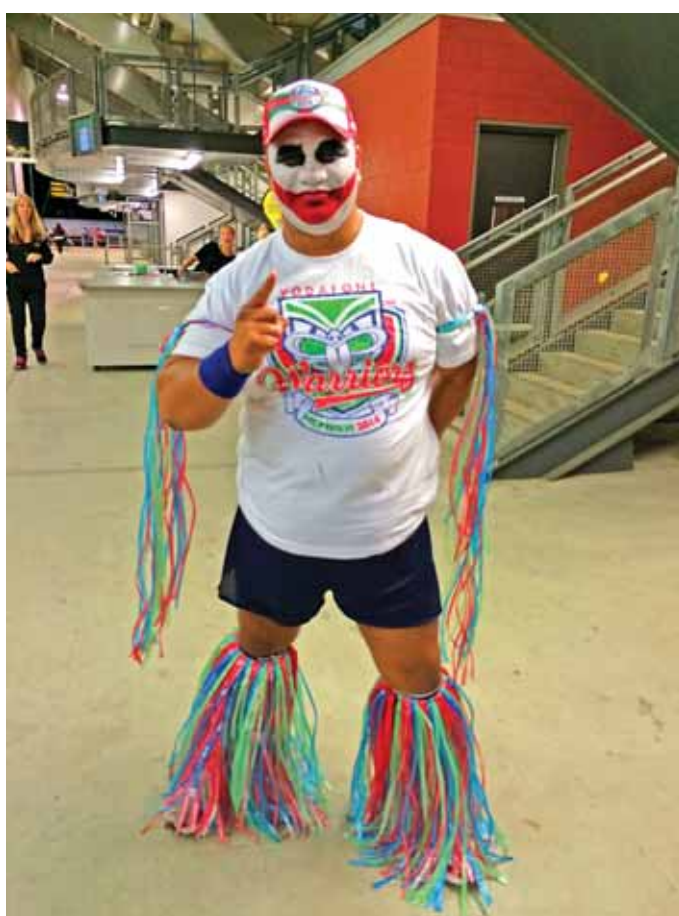
The Mount Smart Joker at last night's trial is looking forward to the Dick Smith Auckland NRL Nines