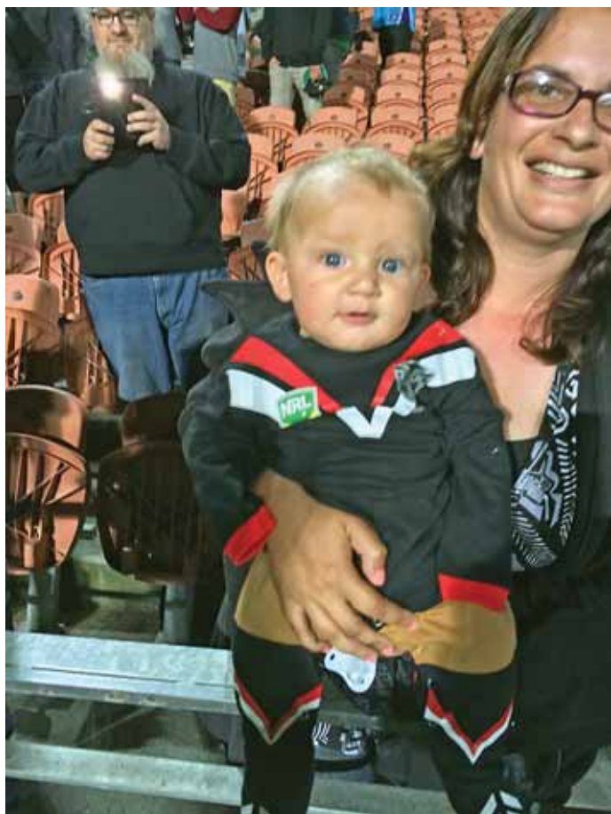
The fans came in all ages, last night. Love this photo!