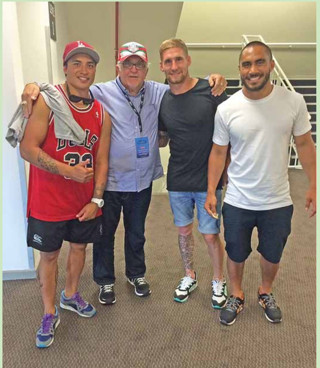
Me and the boys (L to R) Kevin Locke, Sam Tomkins and Thomas Leuluai.