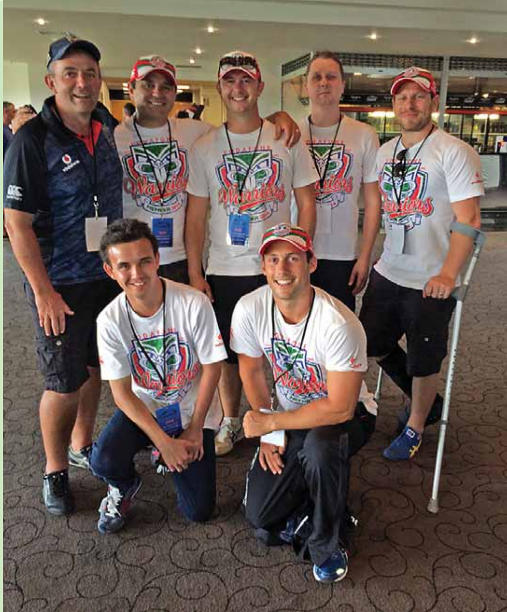
The staff from the Vodafone Warriors were out in force at the pre-season game. Here are some of the boys.