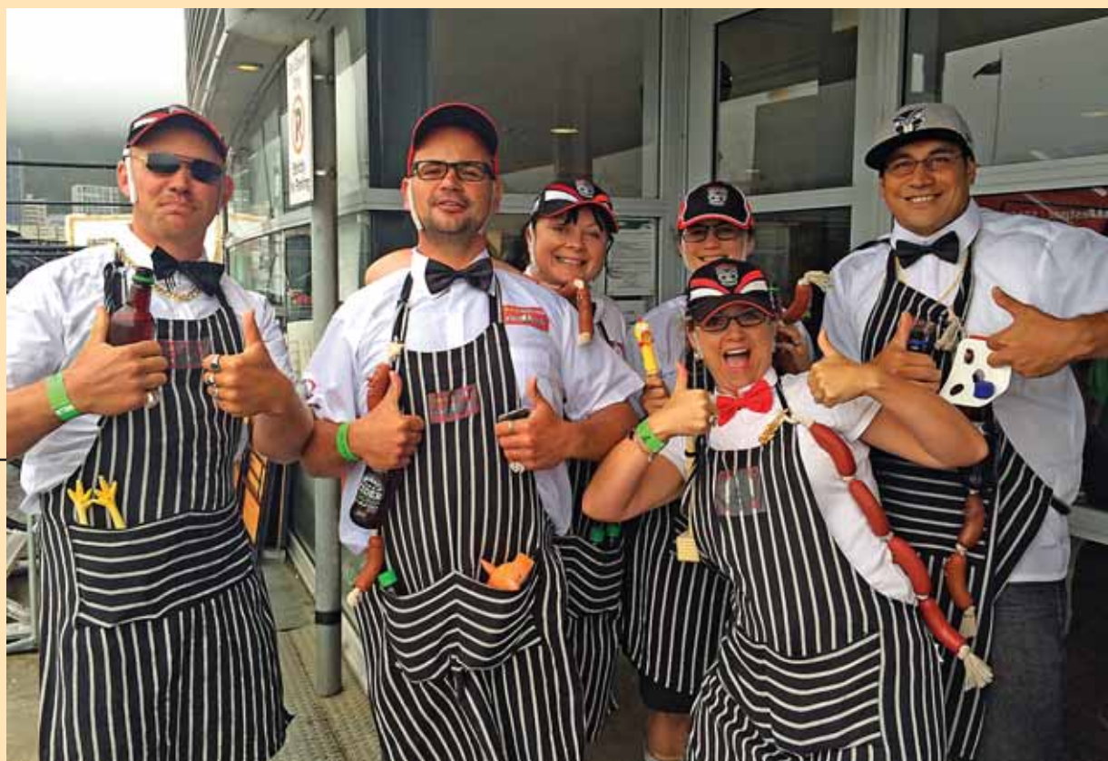
The FAKE Mad Butchers from Pukekohe at the Wellington Sevens.