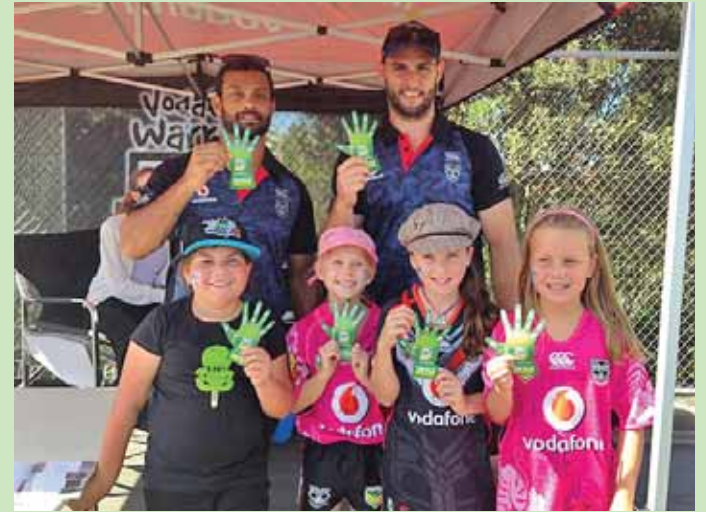
When the boys weren't playing their time was taken up doing PR duties!