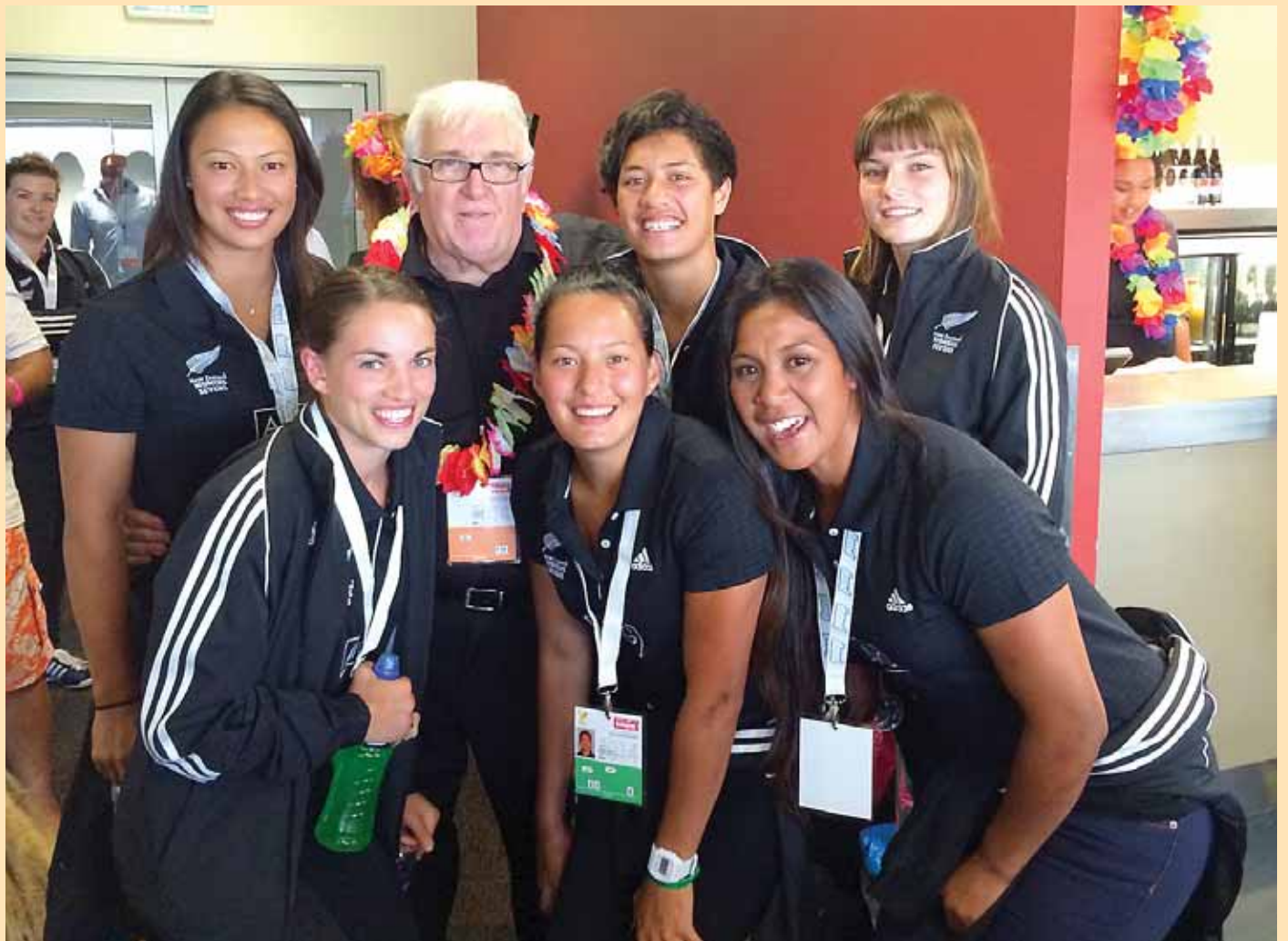
We were very privileged to have the Black Ferns come into the J. A. Russell Lounge at the Wellington Sevens.