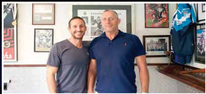
DAD AND I POSING FOR RUGBY LEAGUE WEEKLY