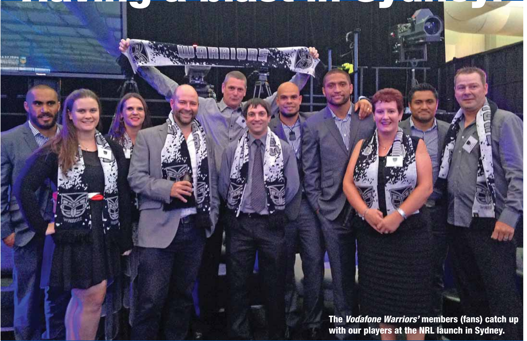
The Vodafone Warriors' members (fans) catch up with our players at the NRL launch in Sydney.