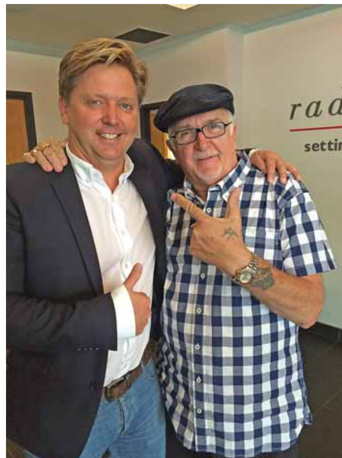
And I ran into this bloke while at the radio station! You may have seen him on Shortland Street.