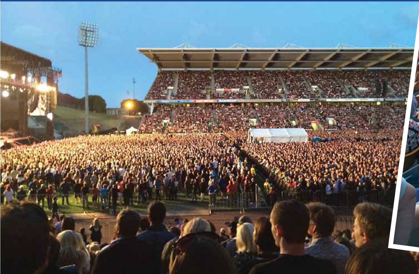
The Crowd at Mt Smart for the Bruce Springsteen concert: What a night! One of the best concerts, ever.