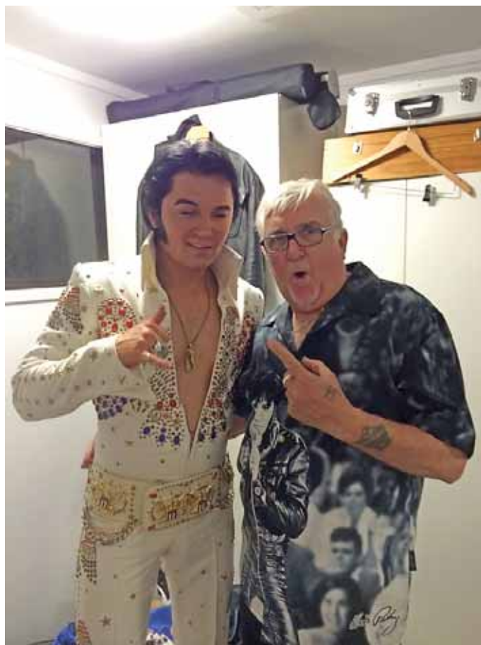
Elvis was in the house! And this guy was great, even looks like the king.