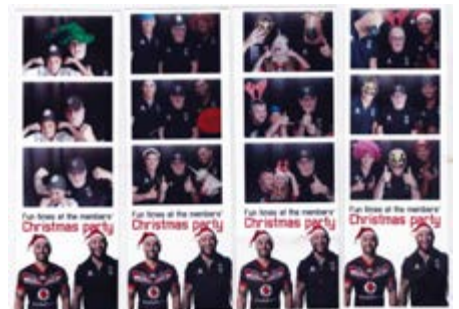
Fun times in the photo booth.