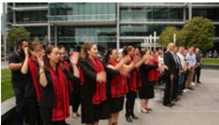
Vodafone's Culture Group gave a very powerful and unique welcome to the newest recruits into the Vodafone whanau.