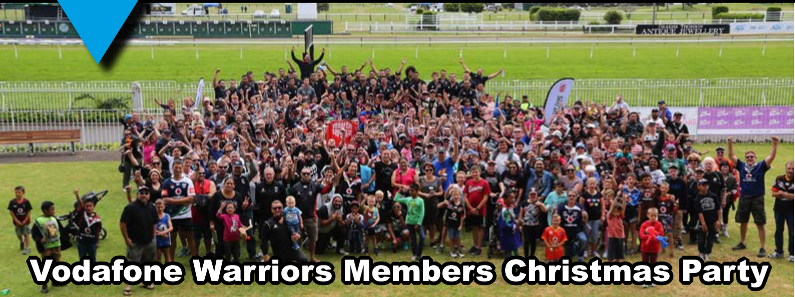
Vodafone Warriors Members Christmas Party

No advertisements are paid for in this newsletter.