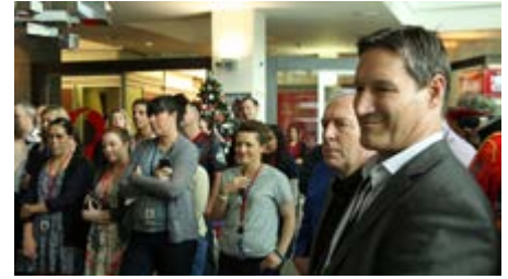
Vodafone staff got up close and personal with their questions, selfies and signing session.