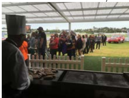
The Mad Butchers sausages were a big hit on the Vodafone Warriors members day.