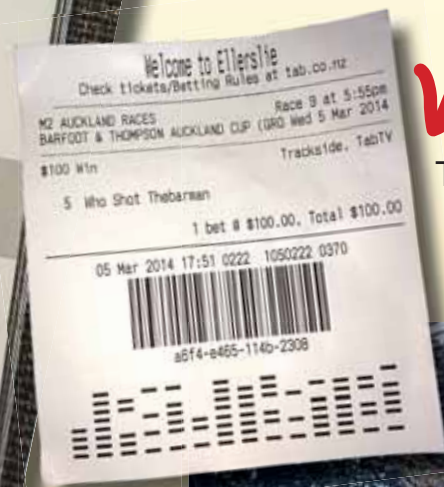
The winning bet ticket!