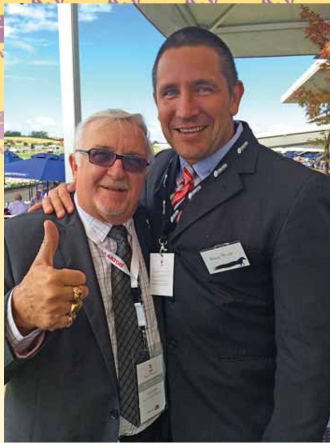
It was great to catch up with rugby league legend, Steve Price, who had a great day as well.