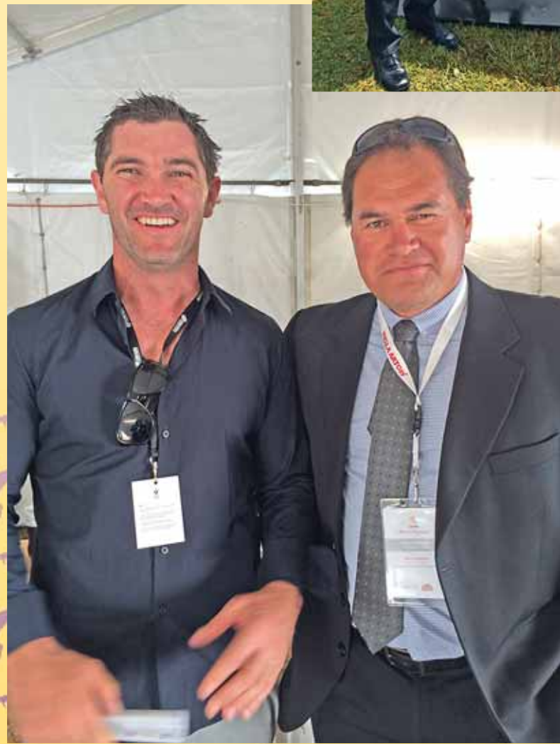
Stephen Donald, that guy who won us the Rugby World Cup in 2011, with Chiefs coach, Dave Rennie.