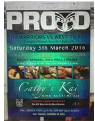
CAMPBELLTOWN SPORTS STADIUM

We hope that you enjoy the game and thank you for your support.