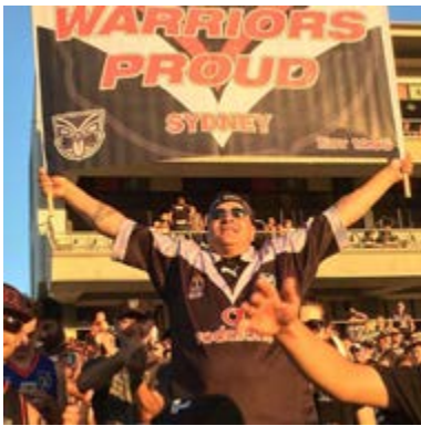
Thank you fans for all your loyal support.