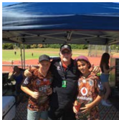
Just caught up with these two big Warriors fans.