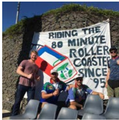
Another great sign at the game.