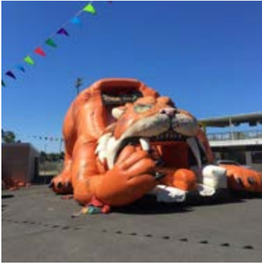
When you arrived at the stadium this bouncy castle let you know that your in Tiger country!