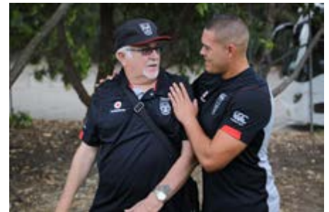
That loving moment.