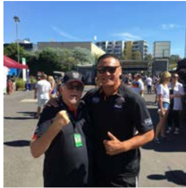
Great catching up with former Kiwi David Kidwell, a great mate.