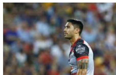
Shaun Johnson eyes up a kick.