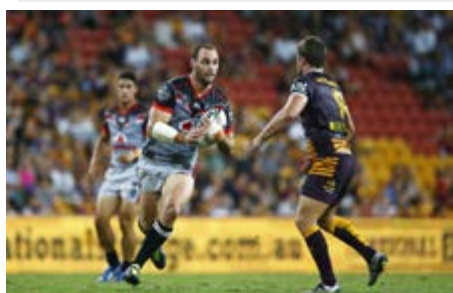
Simon Mannering on the run.

There's bound to be more calls for the head of coach Andrew McFadden ahead of this week's first home game against Melbourne.