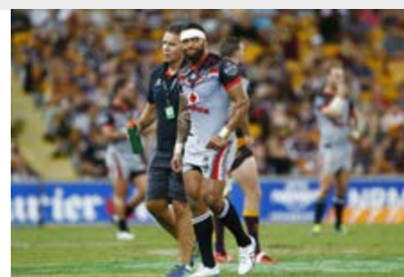
Warriors' Manu Vatuvei walks off after suffering an injury.