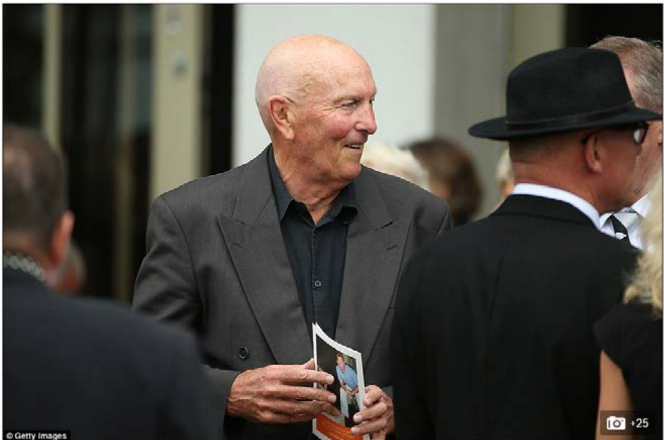
Former athlete and politician Les Mills pictured outside the service in Auckland

Winners: send us a pic of you and your jersey to: pcleitch@xtra.co.nz