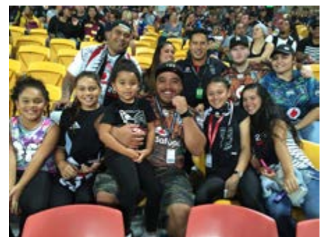
Awesome fans at our away games.