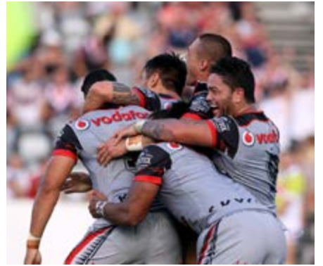
The boys celebrate their win

Mounties 50 Illawarra 16 Newtown 38 Wests Tigers 14 Penrith 50 Manly 12 Wyong 28 Canterbury 22 Wentworthville 26 NZ Warriors 14 North Sydney 24 Newcastle 10