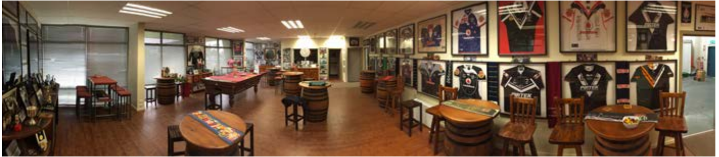
A couple of photos from inside the museum.