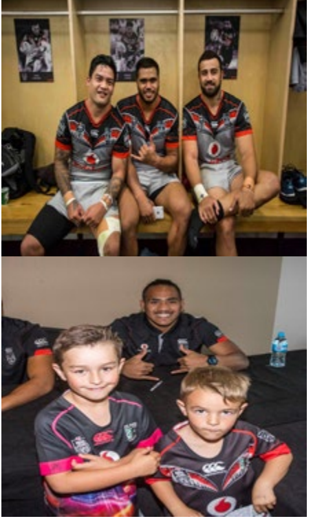
These two young boys loved the signing session at the Rydges hotel.