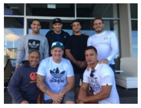
Took these Bulldogs out for lunch last Friday in Wellington (sharing the love).

Made these 2 young guys night I went out after the game a got them out of the crowd and took them into the teams changing room.