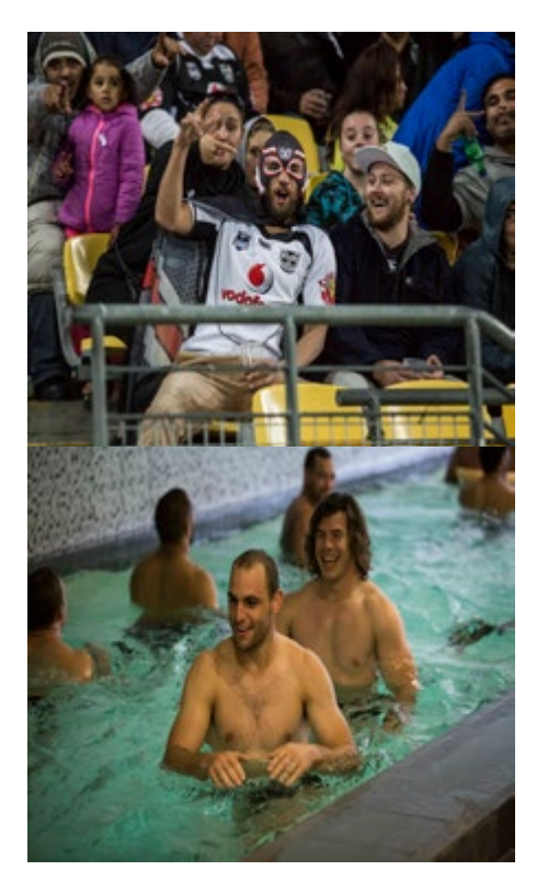
The boys cool down in the pool.