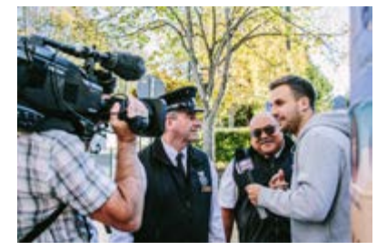
Beau filming in Christchurch

Sky Sport 2 at 10.40pm on Wednesdays Repeated on Sky Sport 2 at 5pm Fridays Check your guide for details