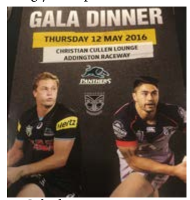
Gala dinner programme.