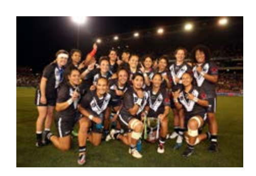
The Kiwi Ferns after their win.