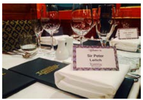
We had a lovely meal with personalised name card and fantastic service,