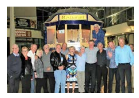
The rest of the dinner group.

Check out www.welcomeaboard.co.nz for more info on this Christchurch icon.