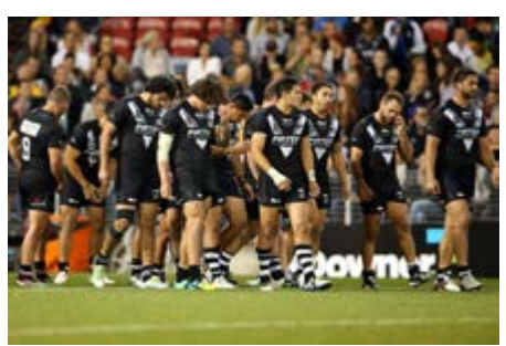
Kiwis dejected after their loss.