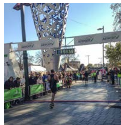
Leighton Corpedo Corbett in Christchurch