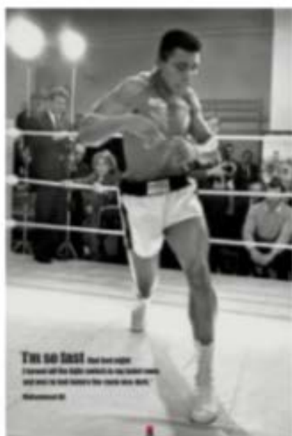
PP31043 - I'm so fast...