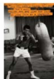
PP32141 - Ali Punching Bag