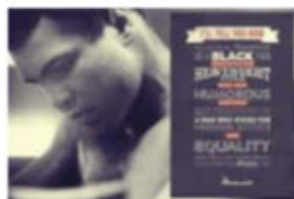
PP32710 - Ali Quote