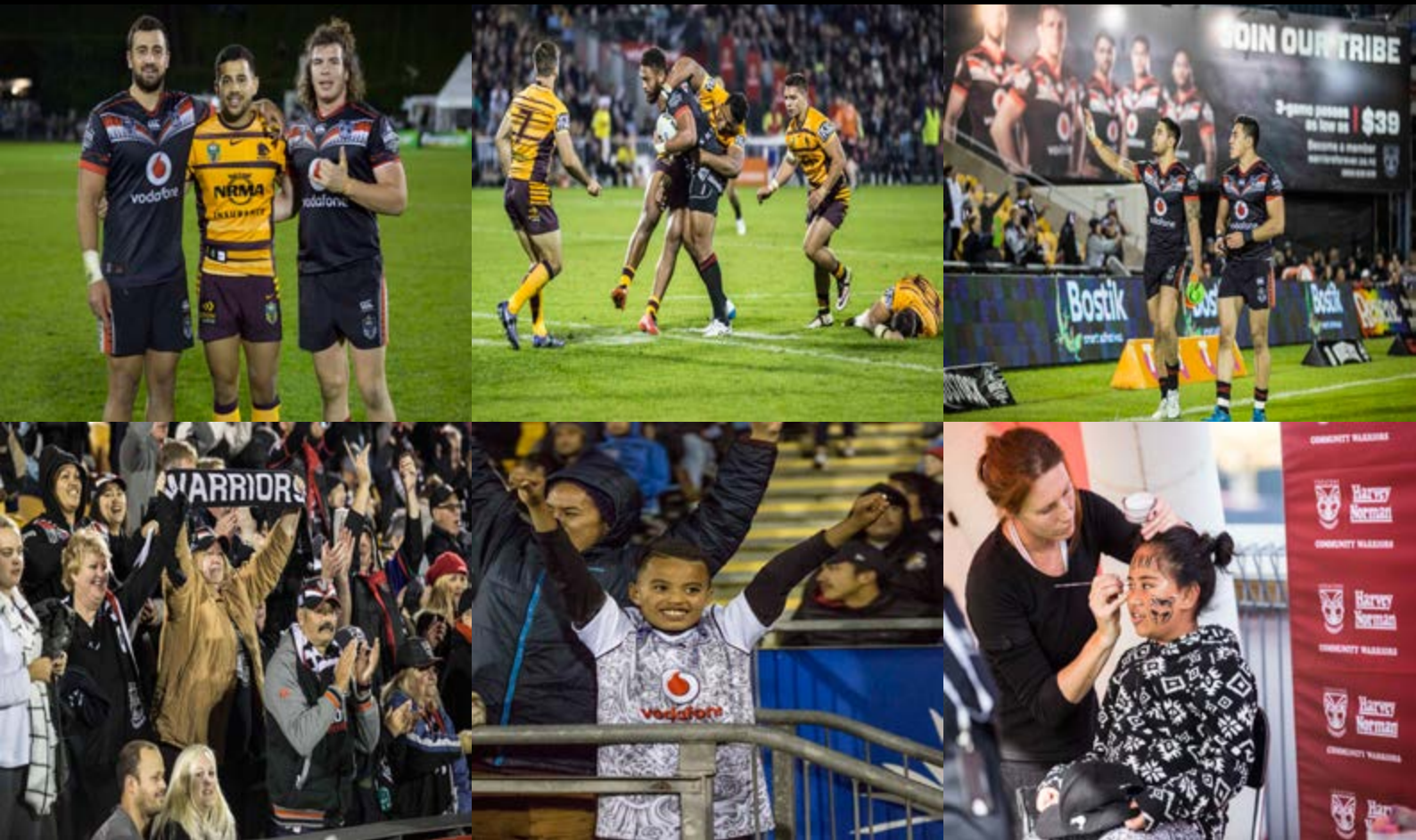
Celebrations in the dressing room after beating the Broncos 36-18. Vodafone Warriors v Brisbane Broncos.