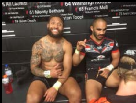
Manu Vatuvei and Thomas Leuluai.