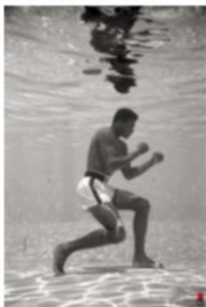
PP32341 - Ali Swimming Pool