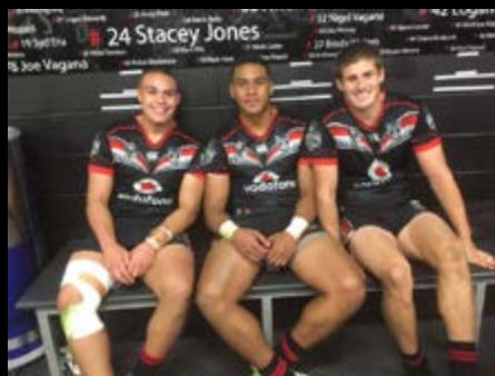
Tuimoala Lolohea, David Fusitu'a and Blake Ayshford.