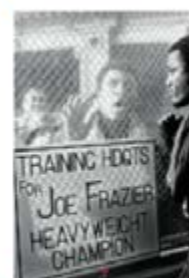
PAS0365 - Ali vs. Frazier - Window Taunt