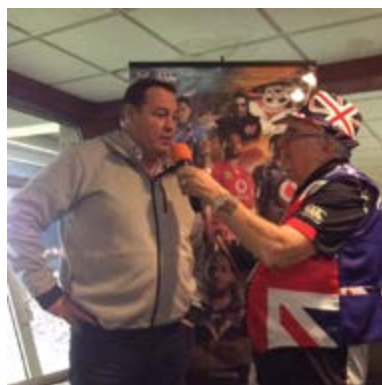
Sir Peter interviews All Black Coach Steve Hansen