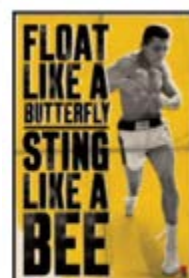
PP31685 - Float like a butterfly...