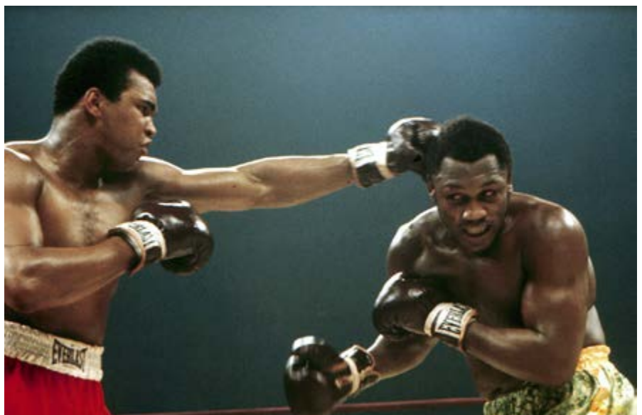
Muhammed Ali (Cassius Clay) punches Joe Frazier during their boxing match, 1971.

In my opinion Ali is the greatest because of what he had to overcome to be the greatest, his path to fame, fortune and success was difficult. His record in the ring was impressive 61 fights, 56 wins, 37 by knockout and five losses. A man who lost everything for years for standing up for his beliefs to ultimately coming back to reclaim his world heavy weight title was remarkable. At a young age, Ali called himself the greatest. Nearly 50 years on, it is safe to say, he is truly the greatest athlete to step on this earth.