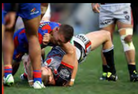
Danny Levi tackles Simon Mannering.