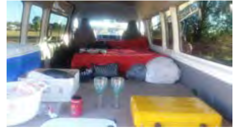
The breakfast table.