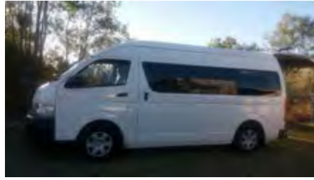
Our van we will be travelling in.