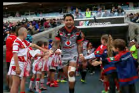
Issac Luke runs out for his 200th NRL game.