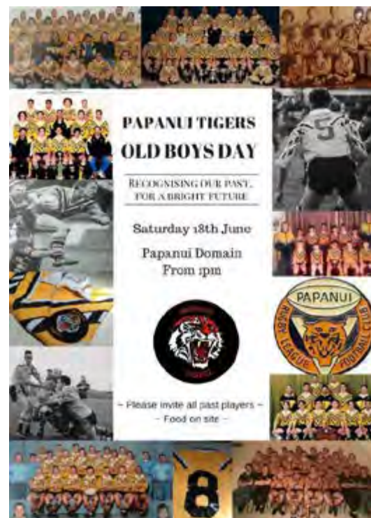
Papanui Tigers Old Boys Day, 18th June at Papanui Domain from 1PM.