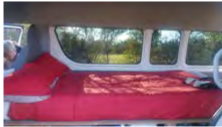
The sleeping quarters.