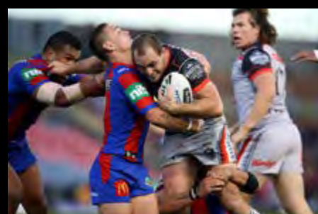
Simon Mannering tackled by Danny Levi.