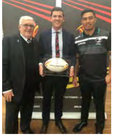
Each city hosting a Rugby League World Cup game is giving an official ball to be display around the city. Pictured with the Wellington ball is Wellington Deputy Mayor