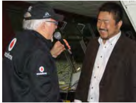
The JAPANESE MAD BUTCHER Arato Tsujino.