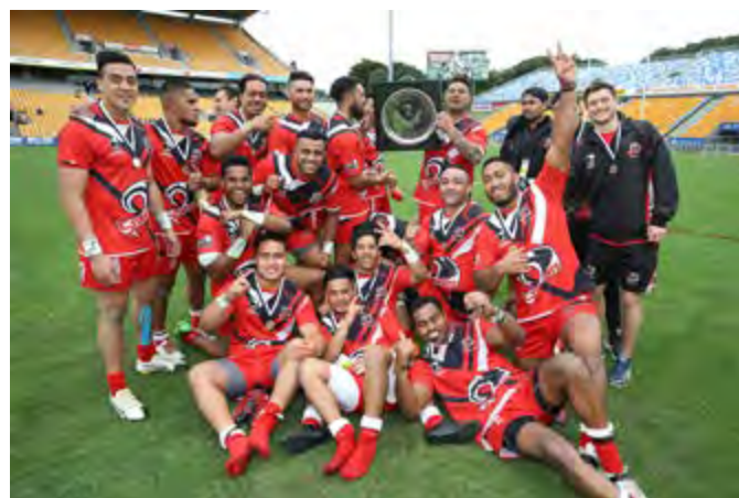
Counties Manukau Stingrays celebrate their 2015 NZRL National Premiership victory

Saturday, September 10 - Northern v Central Saturday, September 10 - Southern v Development Saturday, September 17 - Central v Southern Saturday, September 17 - Northern v Development Saturday, September 24 - Development v Central Saturday, September 24 - Development v Central