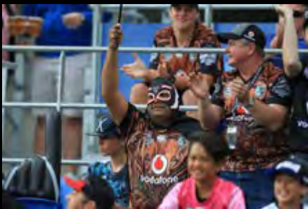
Fans cheering on the boys.