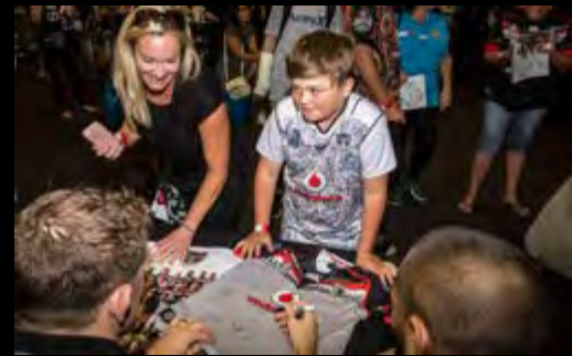
Photos from the members function after the game.