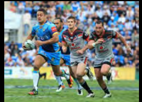
Jarryd Hayne is chased by Bodene Thompson and Blake Ayshford.