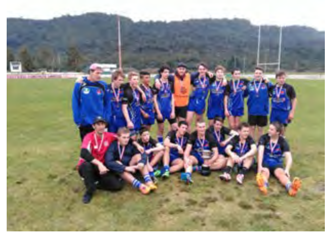
16s had just received medals and trophy for winning the main comp and grand final.