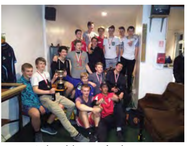
At their clubrooms after the game.