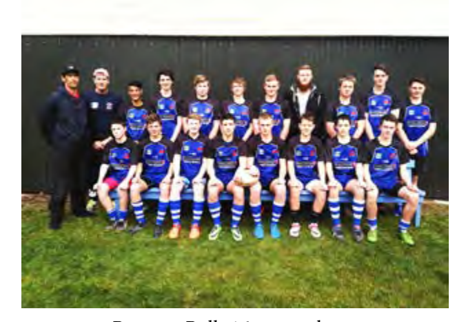
Brunner Bulls 16s team photo.