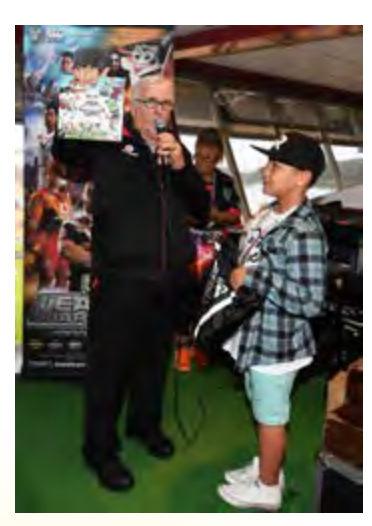
A young fan receives a box set of the League Libraries