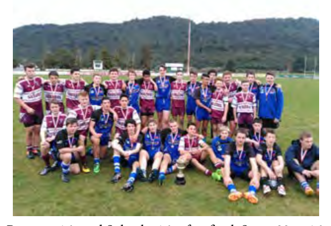
Brunner 16s and Suburbs 16s after final. Score 32 to 16.