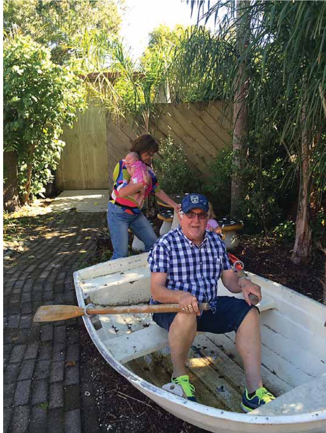
Now you know why they call me mad – trying to row a dinghy on dry land!