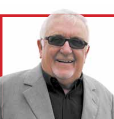
The Newsletter Team

Here are the team that help me make the newsletter each week, Between us we make the newsletter happen - and like everything it is a team effort.