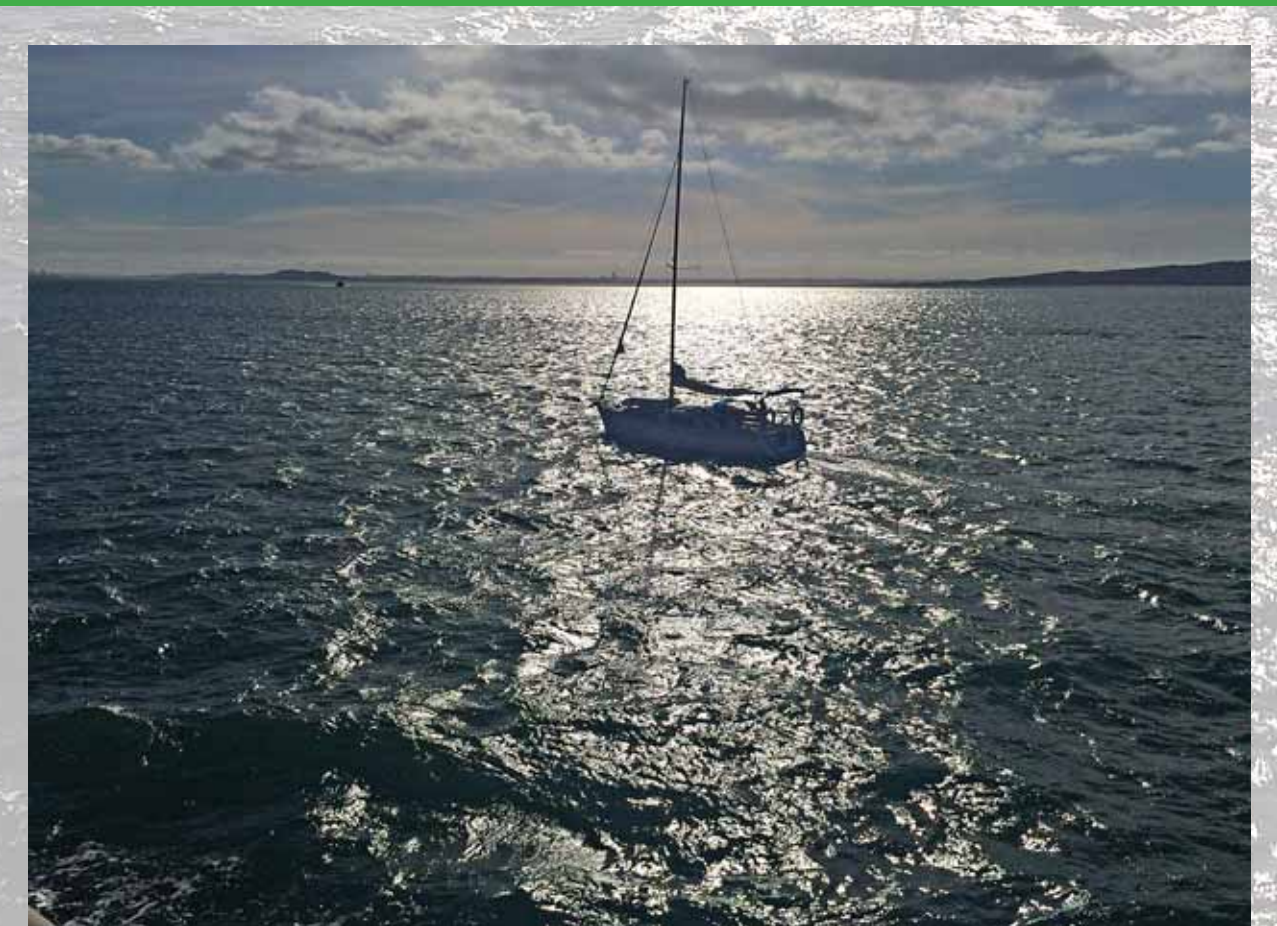
Thought I would share this photo with you taken from the SeaLink car ferry at 3.15pm on Monday.