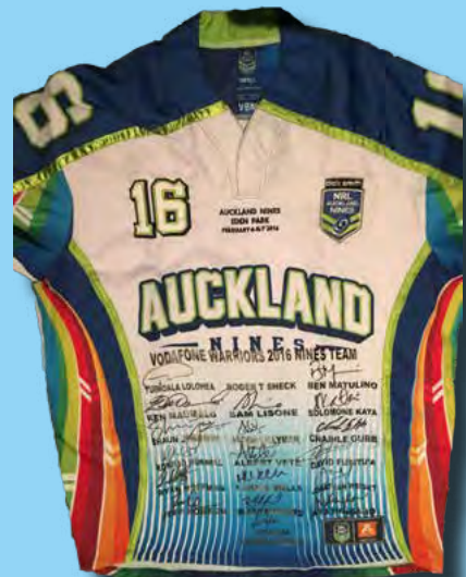
1x Signed 2016 9s Shirts (Signed by Warriors Squad)

Giveaway P.O Box 54295 The Marina 2144, Manukau, Auckland New Zealand