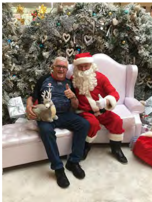
I gave my Christmas order to the man himself.