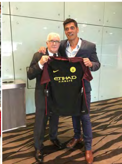
New Vodafone Warriors Coach, Stephen Kearney with the football jersey I bought for him (my early Christmas present for him) at Manchester City. He is a big fan of the club.