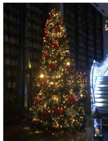
Some of the Christmas decorations I saw in the UK