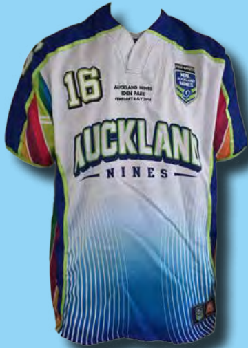
5x 2016 9s Shirts Large