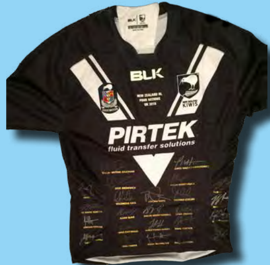
1x Signed 2016 Kiwis Jersey (Signed by Kiwis Squad)