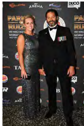
Victoria Cross winner Willie Apiata and partner.