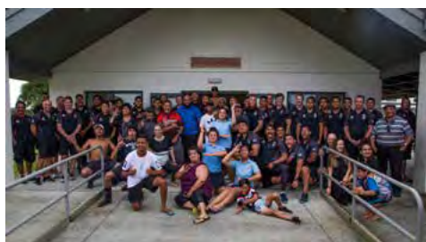
Marae Group Photo.