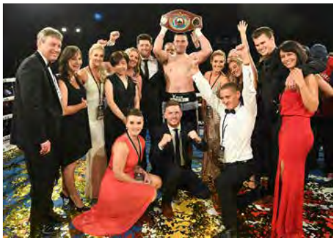
Parker and the Duco team share the moment.