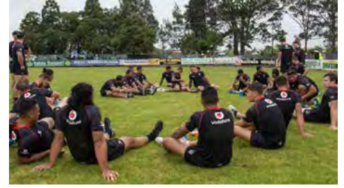
Team stretching in Kaitaia.