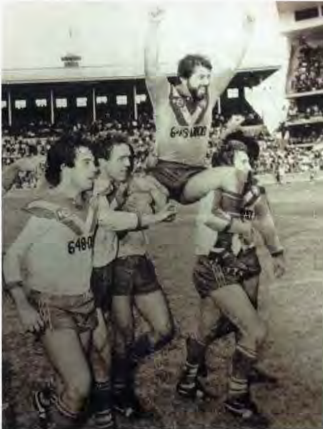
George Peponis is chaired off by teammates after leading the Bulldogs to the 1980 premiership.