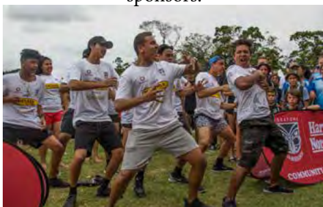
Kaitaia College Haka.