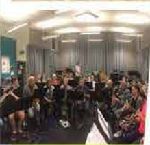
HBC COMMUNITY BAND