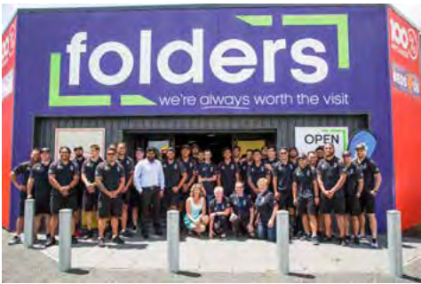
Team visit Folders.