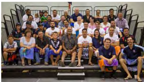
Current and former Kiwis with local sponsors.