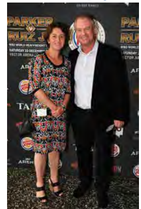
Dame Susan Devoy former International Squash player and former All Black Grant Fox.