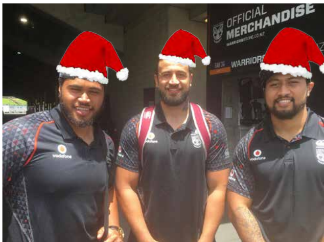
Three of the Warrior Boys Looking Forward to Christmas