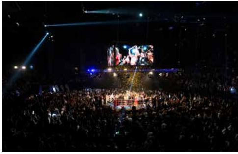
The 10,000 strong crowd on the night.