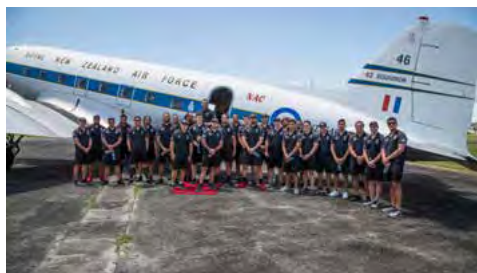
Ready to fly up to Kaitaia in the DC3.