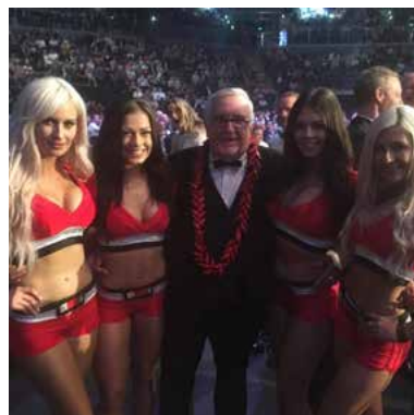
The ring girls just had to have a photo with me.