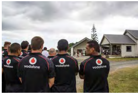
Welcomed onto Waimanoni Marae.