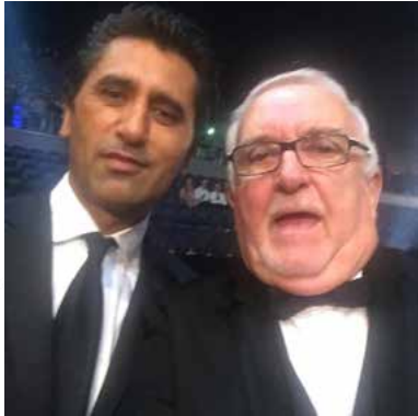
Got to catch up with Kiwi Actor Cliff Curtis. Real nice guy.