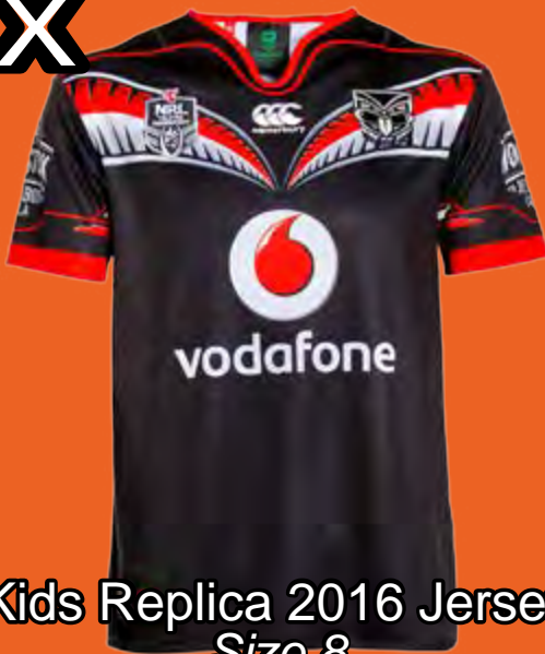
Kids Replica 2016 Jersey Size 8