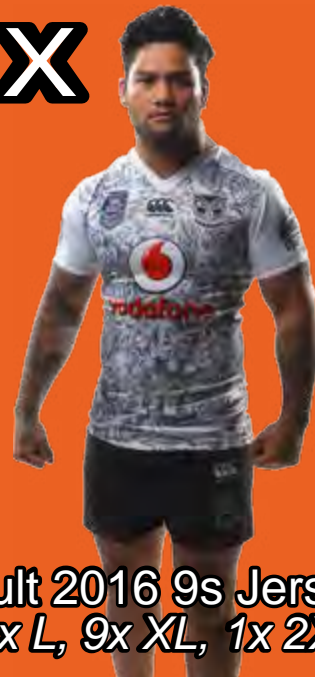
Adult 2016 9s Jerseys 4x L, 9x XL, 1x 2XL