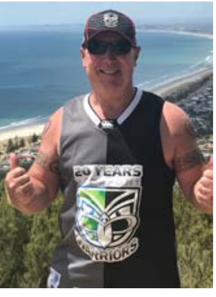
BUTCH, AS you can see I am in pre-season Warriors supporter training.