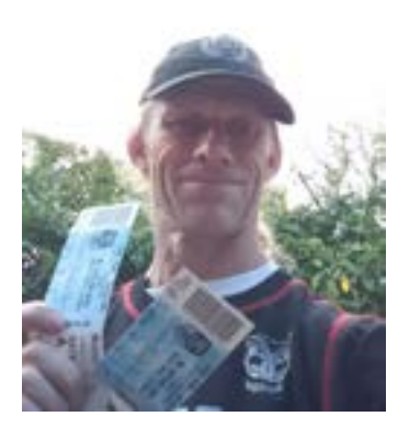
B UTCH THANKS for the nines tickets. Might see you there.

Rob, time you updated your Vodafone Warriors gear mate - Butch