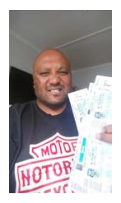
STOCKED TO win the Downer NRL Auckland Nines tickets. Ill be driving up from Wellington.