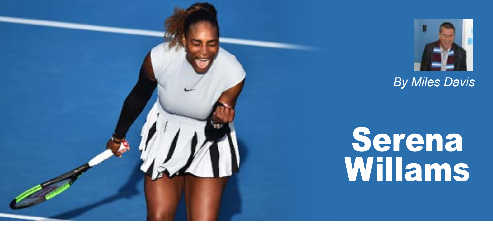
Serena Williams during the ASB Classic WTA Womens Tournament Day 3.

THERE IS no way I can say this without upsetting many people but it needs to be said. Serena Williams is one of the greatest FEMALE athletes ever. There is no doubt that women have been oppressed, suppressed and unfairly discriminated against for thousands of years. The pendulum of life desperately needed to swing majorly in their direction in order to restore parity and justice. Now the pendulum in certain areas has swung too far and honesty has been a casualty. There is a basic fact of genetics that by and large men are stronger and faster than women. This means that in most sports they are able to compete at a more intense and proficient level. Williams insists that she should be referred to as one of the greatest athletes ever rather than categorised in the female section. How can she be one of the greatest athletes ever and yet not even in the top 100 in the history of her own sport? She may be able to beat some men but it is doubtful whether she could beat any of the current top 20 let alone many of the previous generations of champions.