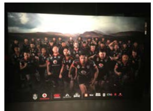
The 2017 team poster.