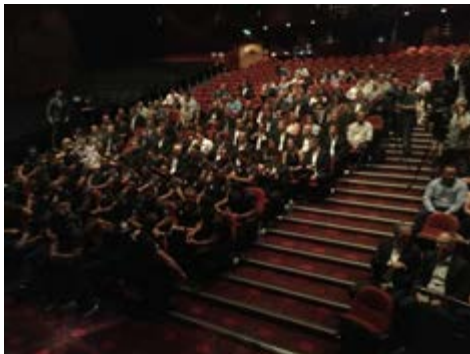
Some of the crowd at the breakfast.