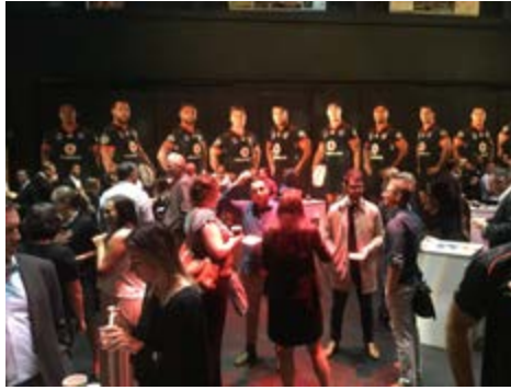
At the Vodafone warriors 2017 launch.