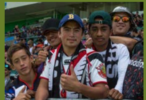
Young fans in Palmerston North