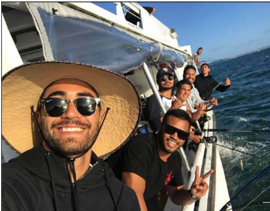
The boys after a hard day fishing.

A WARRIORS' PRESEASON fishing trip turned into a rescue mission after a man went missing at an Auckland beach.