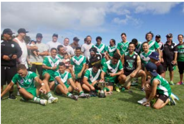
Pt Chevalier celebrate first ARL Nines title

Click here to watch games from the Sportsafe ARL Nines.