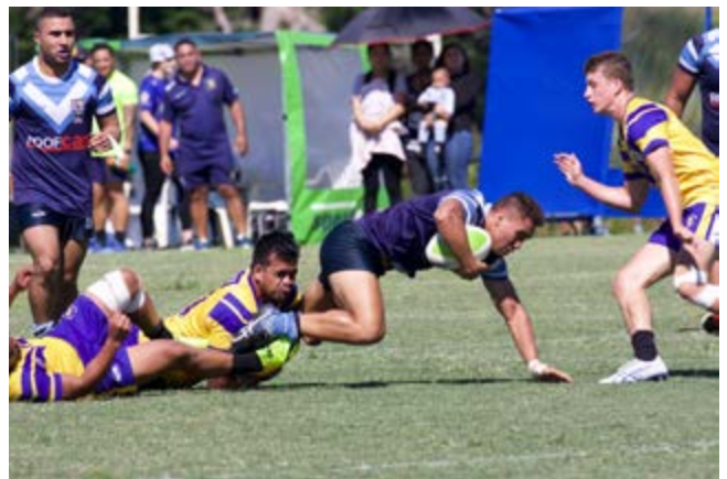
Otahuhu vs Mt Albert - ARL Nines