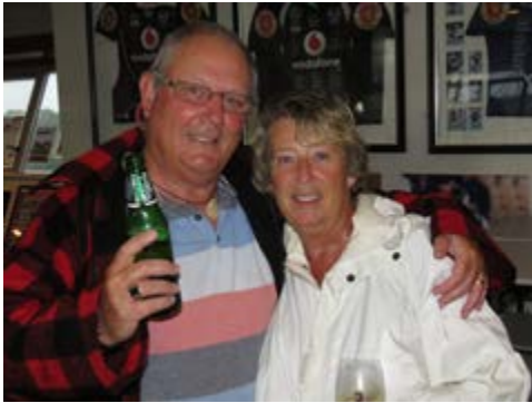
The McHues from Dorset England, by the end of the night they were wearing Warriors jerseys.