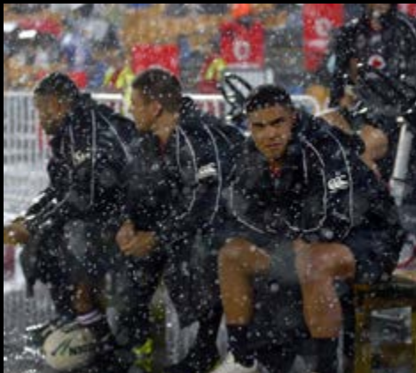
The rain comes down on the Warriors bench