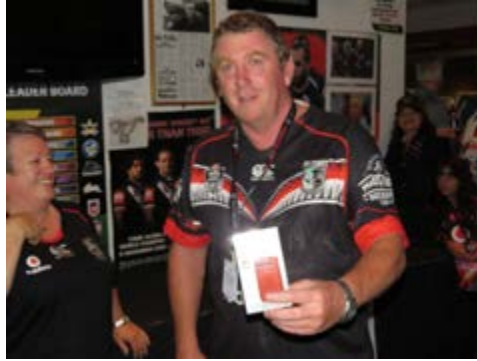
Another Panasonic Radio prize winner.