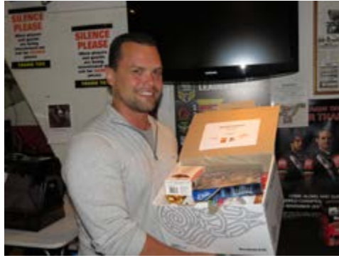
Another winner of the Don Graham Grocery Hamper.