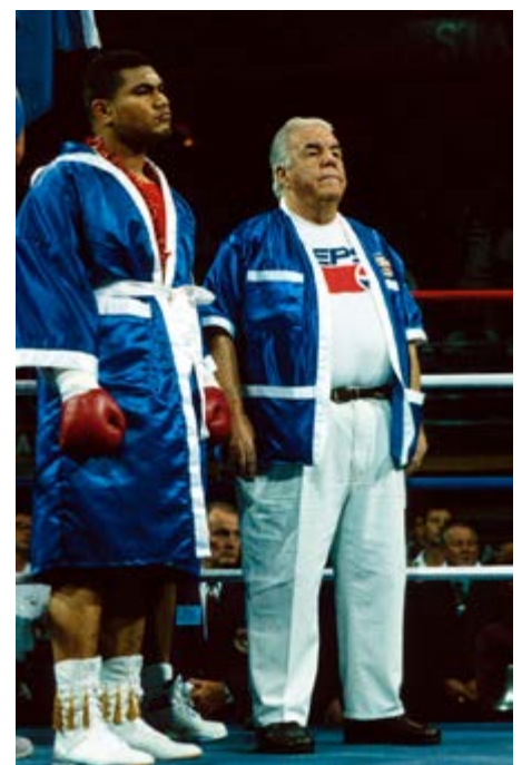
David Tua & Lou Duva 26 Nov 1993.