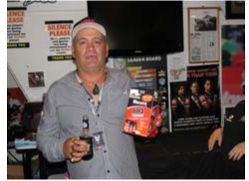
A happy winner with their Selley's BBQ Tough Kit