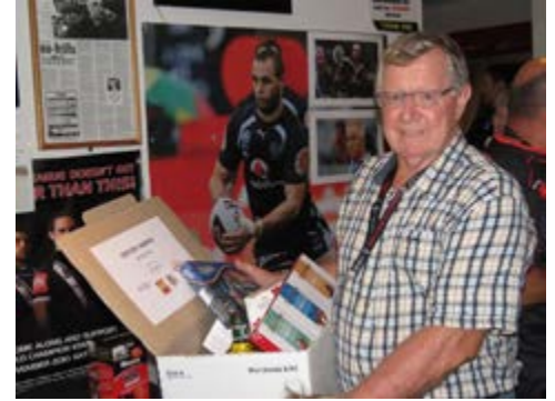
Another winner of the Don Graham Grocery Hamper.