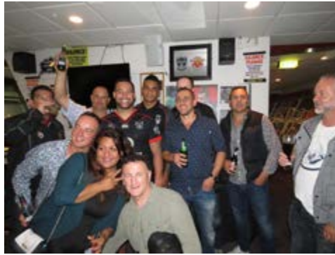
The Papanui Tigers from Christchurch.