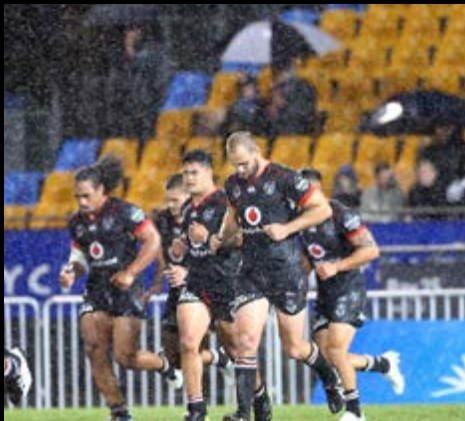
The Warriors run back from their goal line