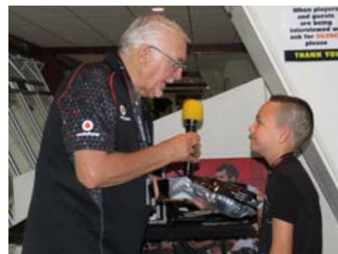
Copper receives a membership.