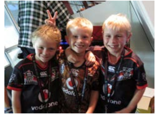
The three musketeers.