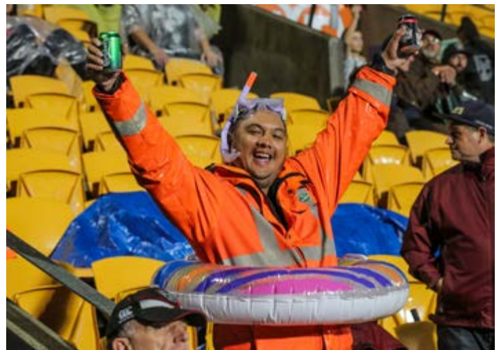
Thisis Warriors fan came prepared for the weather.