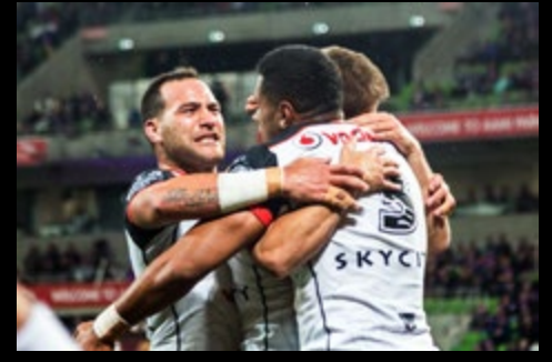
Warriors celebrate after scoring opening try.