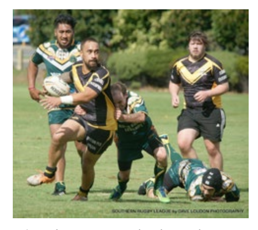
These are from a game between Cooks Rugby League Club (In the green strip ) and Winton warlords Rugby League Club on Saturday 01.04.17 It was a close tight game and Cooks took the win over Winton warlords . The final Score was Cooks 32 / Winton Warlords 28.