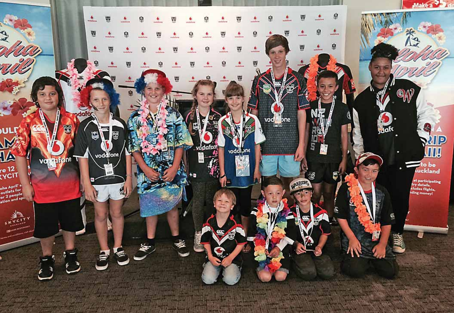
Great to see the kids enjoying themselves at the game.