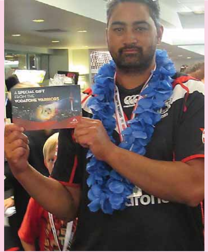
Eru wins a $200 SkyCity voucher.