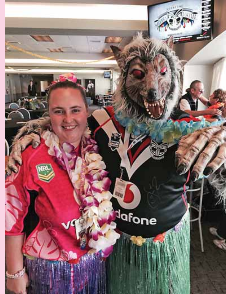
Look at me. True Vodafone Warriors fans.