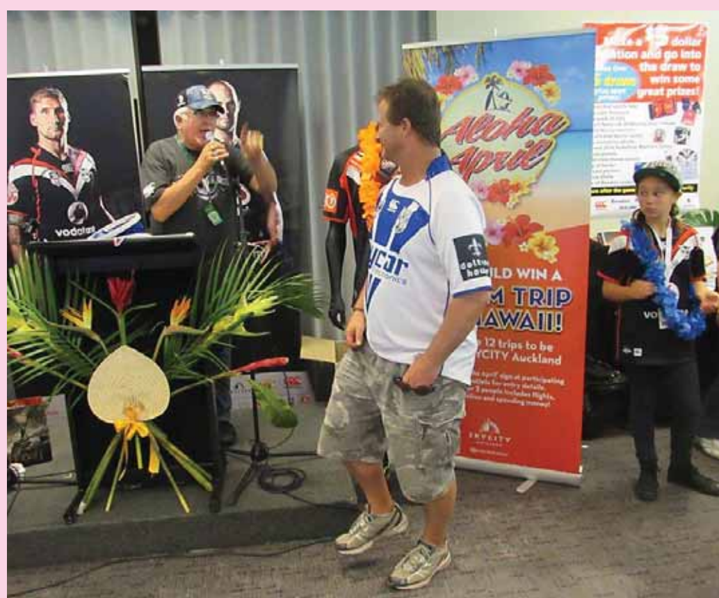
An unfortunate Bulldogs fan standing on one leg for 10 minutes.