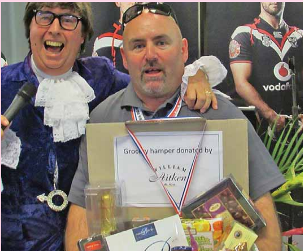
Austin Powers with another (slightly bemused) winner.