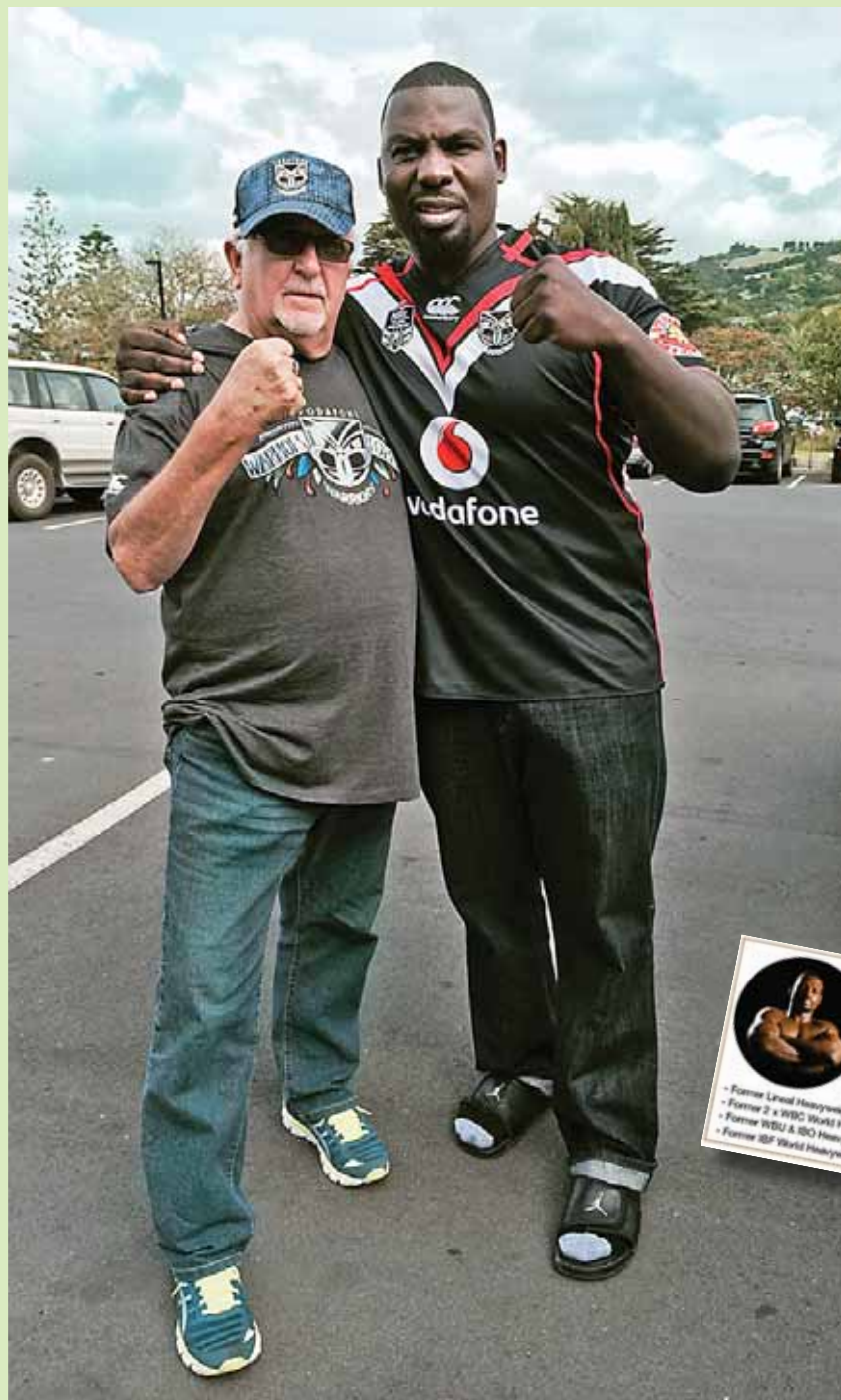
Me and Hasim Rahman, wearing his new Vodafone Warriors jersey.