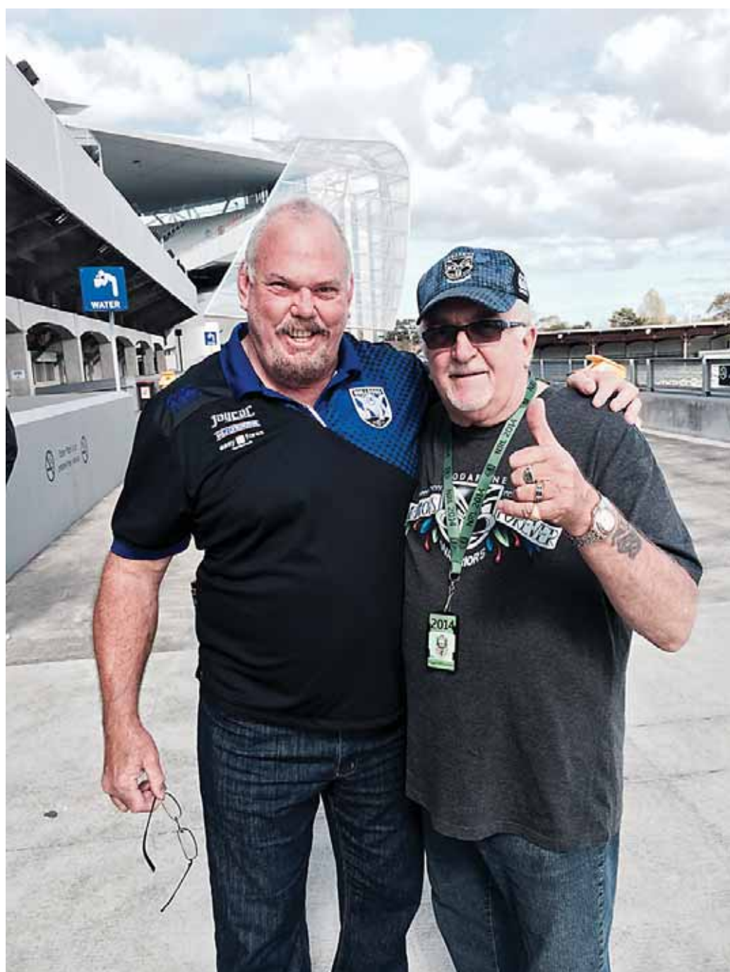
Was great to catch up with my mate Noël Cleal, Aussie rugby league legend, who is now a scout for the Doggies.