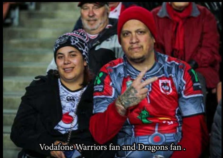
Vodafone Warriors fan and Dragons fan.