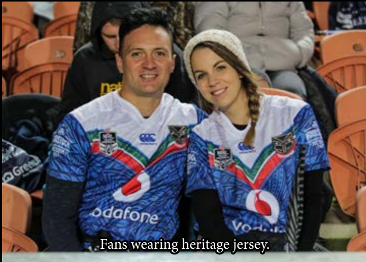
Fans wearing heritage jersey.