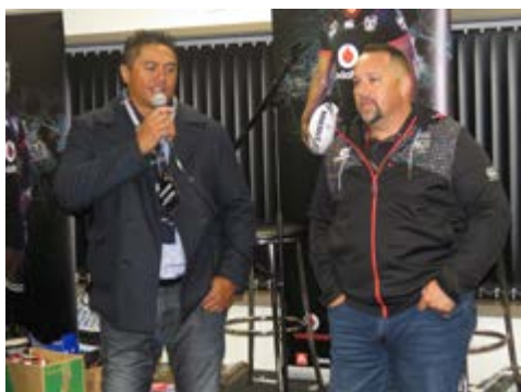
Tawera Nikau speaks with Tony Feasey.