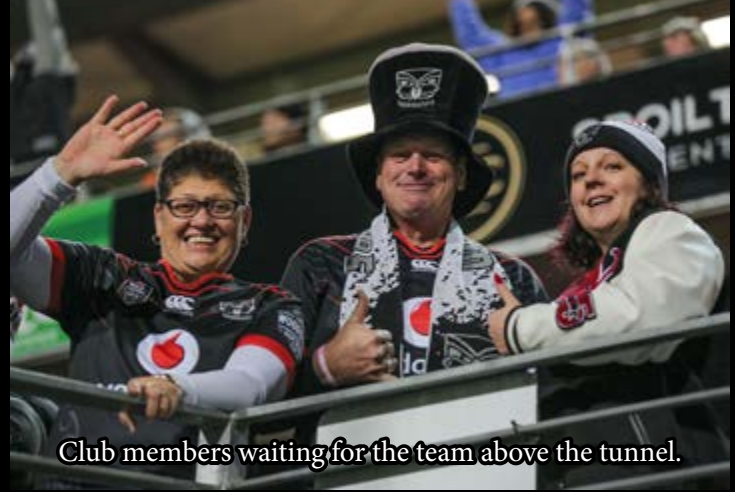
Club members waiting for the team above the tunnel.