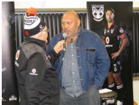
Phil Coffin ex All Black. Member of the 1996 tour of South Africa.