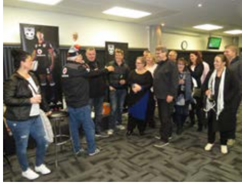
An Invercargill accounting firm were in Hamilton for the weekend.