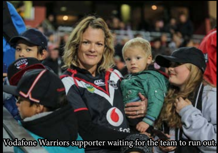
Vodafone Warriors supporter waiting for the team to run out.