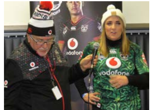
Brodie from the TVNZ Breakfast Show with Sir Peter.