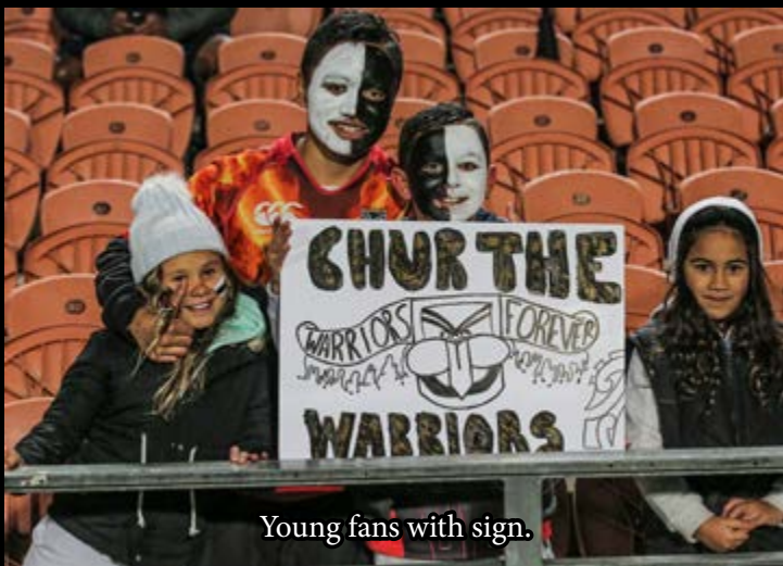
Young fans with sign.