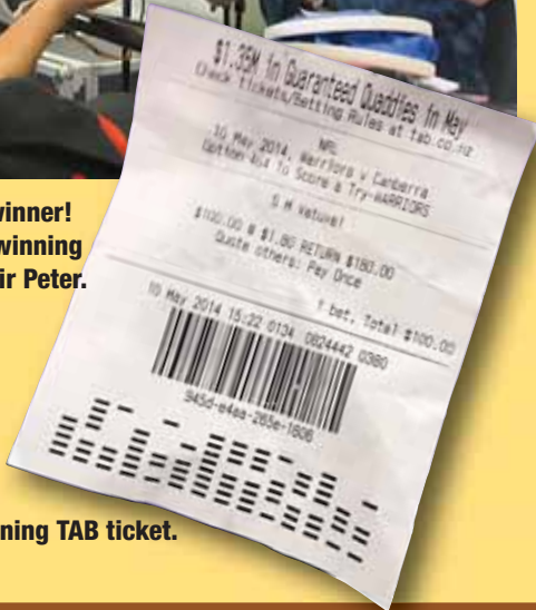
The winning TAB ticket.