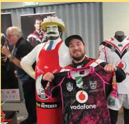
The lucky winner of the signed Ladies in League jersey.