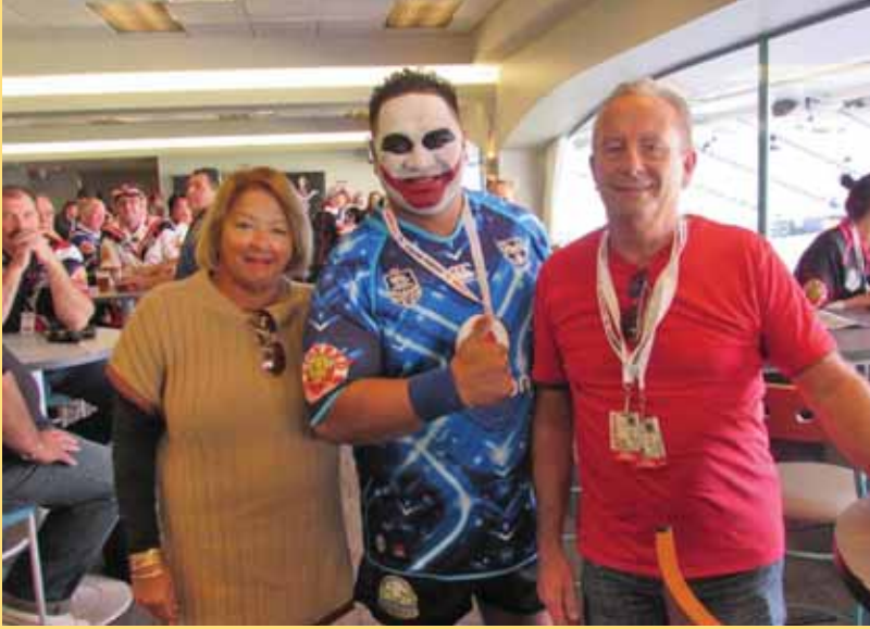
Two very happy supporters with the eden Park Joker!