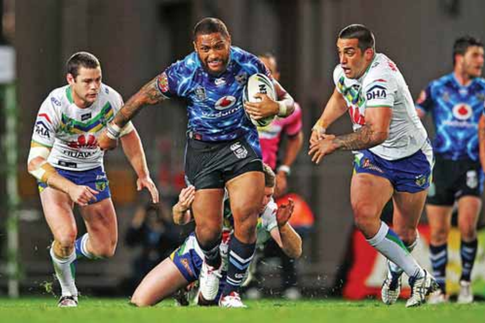
Manu Vatuvei charging through the opposition.