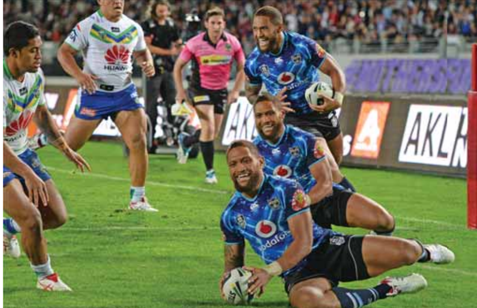
Manu Vatuvei scores a try.