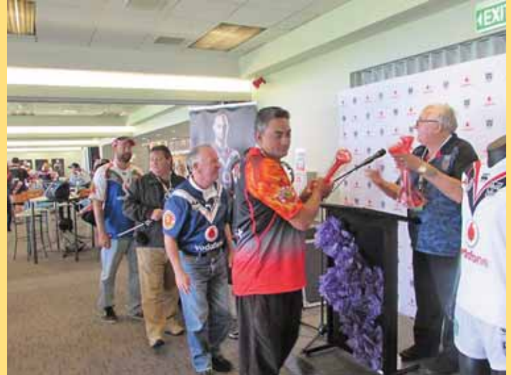
Handing out yard glasses.