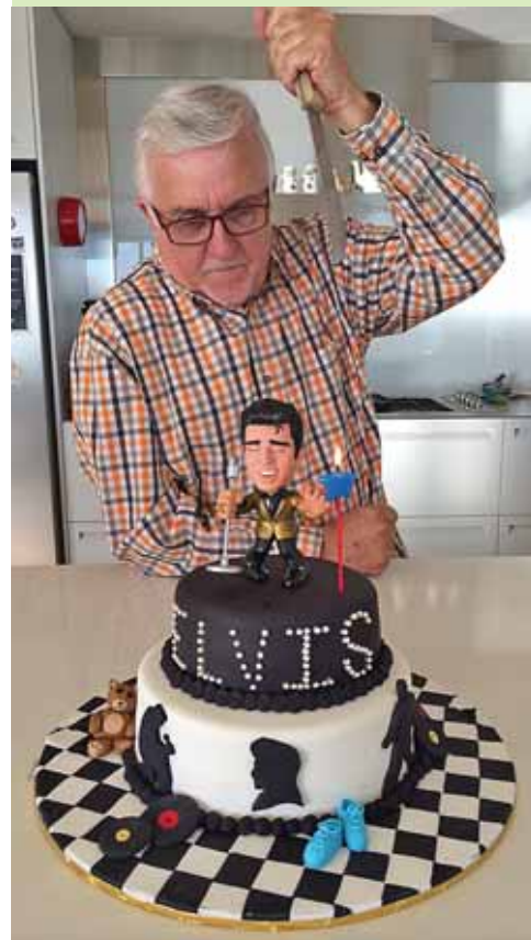
The big cake cutting ceremony.

The big disadvantage though is that I have to find the time to reply to them all.