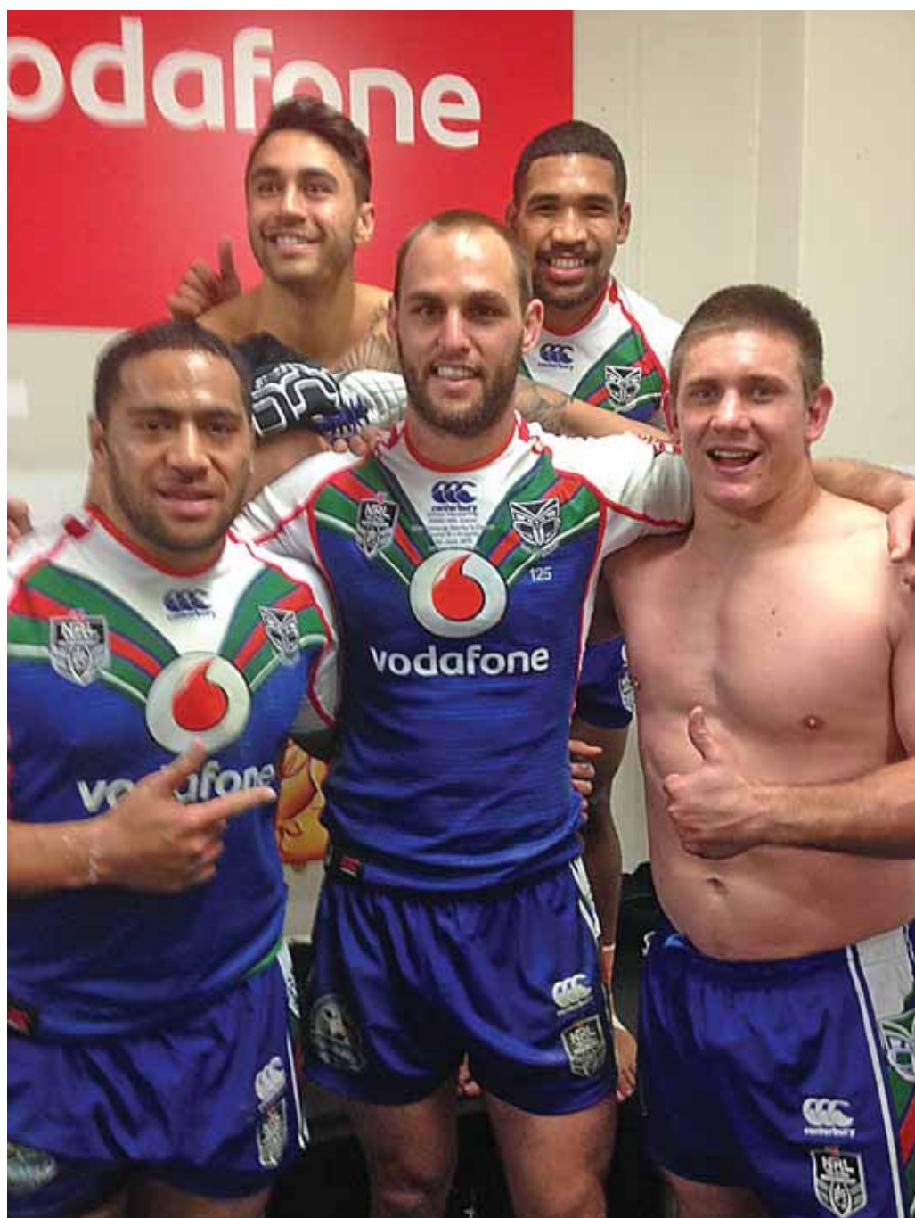
The boys celebrate the captain's big day.