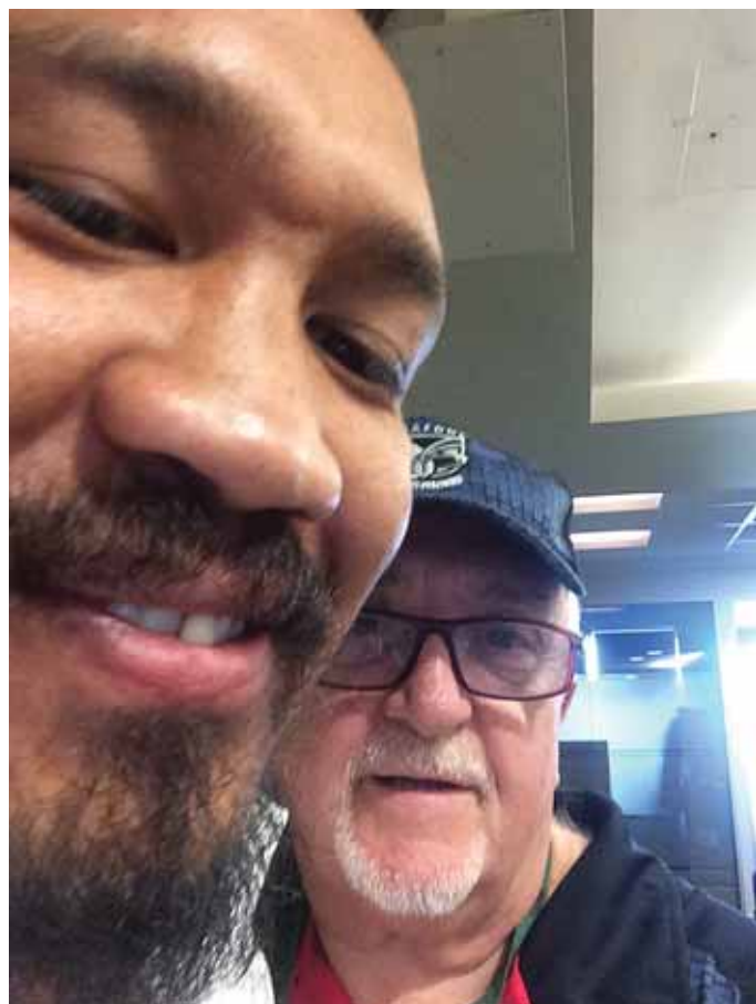
Guess who? Ex-Warrior...