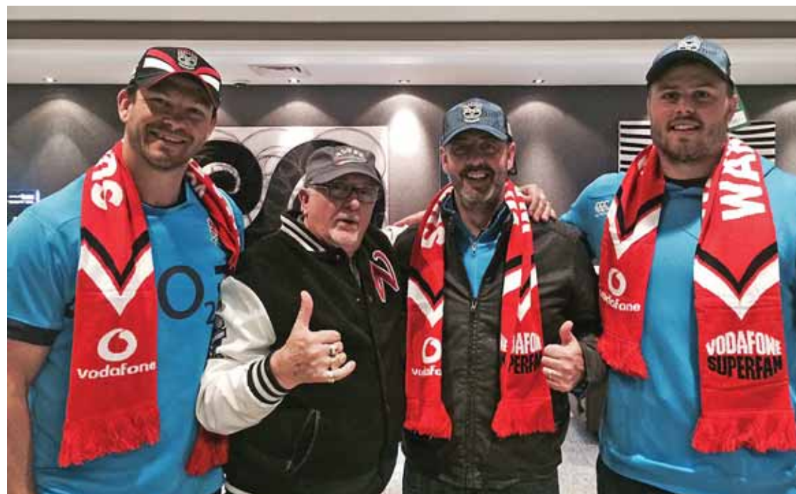
SCARFIES! Asst Coach Andy Farrell, me, Joe Lydon and Mike Brown from the English rugby touring team.

https://www.youtube.com/watch?v=eLRy1S42nFQ