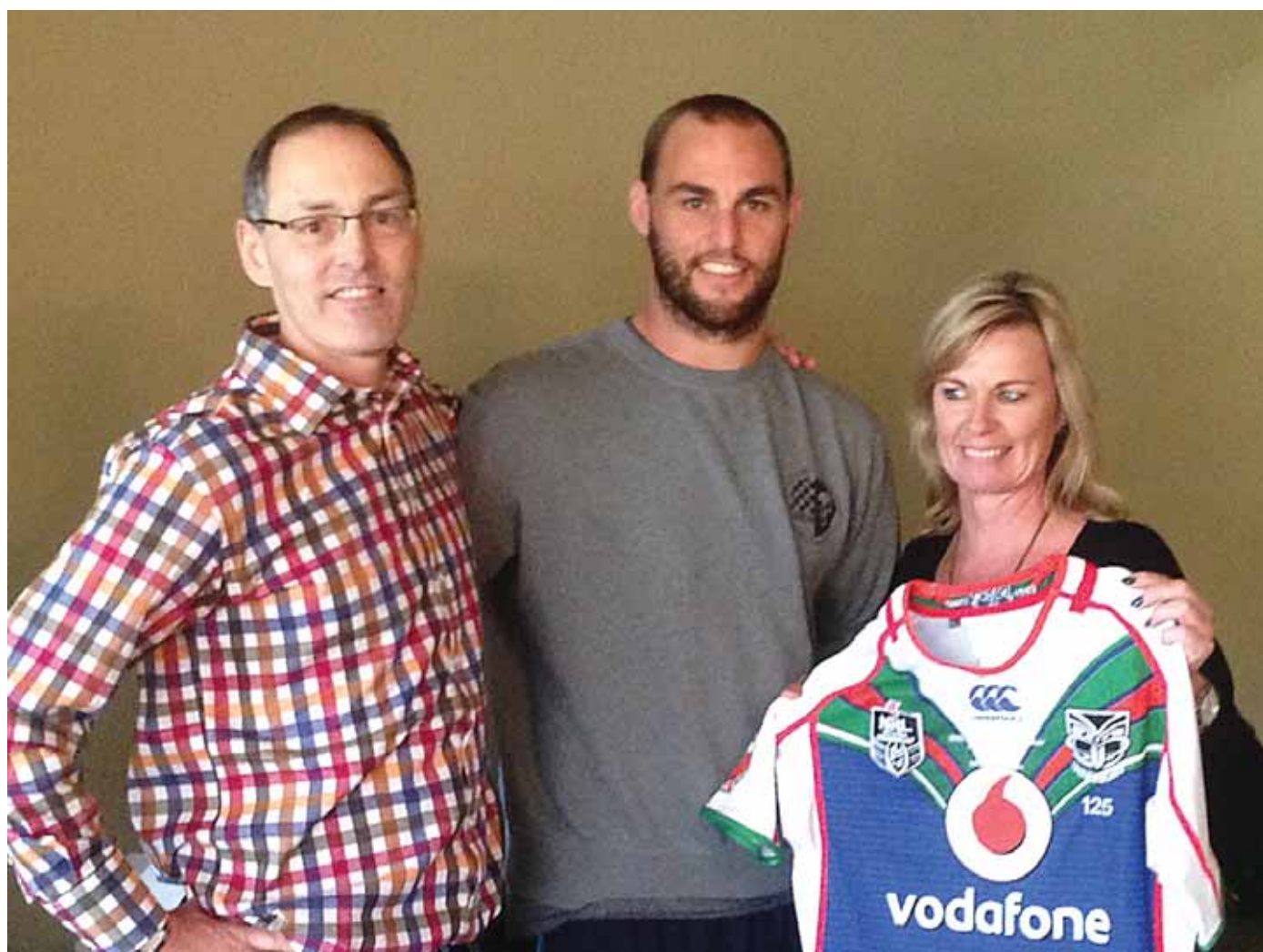
Mum and Dad present their Son with his special jersey.

I shouted the boys to lunch to celebrate Simon Mannering's 200th game. Simon's Mum and Dad were there too, and presented him with his special Warriors jersey. Above, some of the boys in the changing rooms.