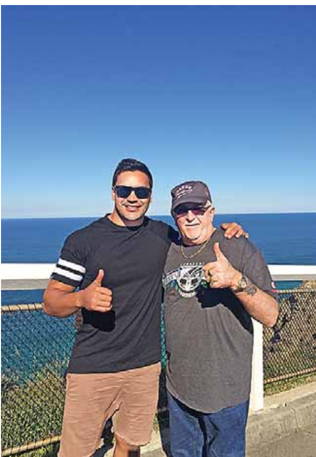
Met up with Alex Glenn, Broncos player and Kiwis player, while we were out sightseeing. Alex played junior rugby league for the Northcote Tigers in Auckland and played for the Junior Kiwis and for the Kiwis in 2012 and is the youngest player to ever captain the Broncos at age 22. In the absence of Darren Lockyer, in a game they won.