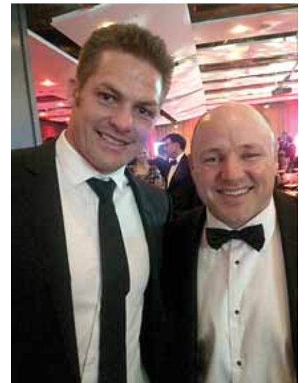
The great Richie McCaw and the coach chill out.