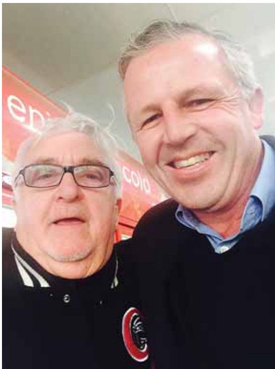
Former All Blacks captain, Sean Fitzpatrick, once handed out the jerseys to the Kiwis ahead of a test in the United Kingdom. A hell of a player and a good guy too.

Then the next day I caught up with the "mother of the nation", Judy Bailey . That's right, the former TV One news presenter. And Willie Apiata , the soldier awarded the Victoria Cross – the highest honour possible – for his astonishing bravery in Afghanistan, when we all got together to judge the Pride of NZ Awards – two top Kiwis.