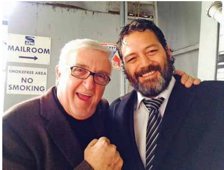
Victoria Cross winner, Willie Apiata is a hell of a man. He is humble and really keen to use his status to help youngsters. A top Kiwi bloke.

On Saturday I flew to Wellington, and who do I catch up with at the Auckland airport but sporting superstar Steven Adams and assistant coach for the Oklahoma City Thunder , NBA team Mark Bryant . What a legend he is, just google him and you will see for yourself. Adams is a monster. I felt like a dwarf next to him, but he is a big man in plenty of other ways too. He is in New Zealand with Bryant – another man mountain – doing some coaching clinics with youngsters. To get an idea of how much he is idolised, there were 400 youngsters at the clinic, and every one of them decked out in a Thunder T-shirt. It would be churlish not to mention fellow Wellington