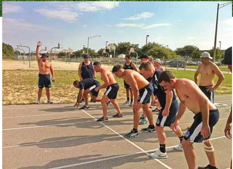
Training in Florida's 30-plus degree heat was a challenge for the Thunder team and their game against the Pioneers will be played in four quarters to allow for water breaks for the players.