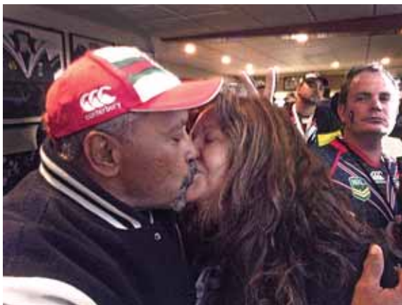
Love was in the air in the Lounge on Sunday.