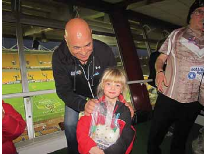
This lovely young lady is our youngest member and she turns up for every game! Now if that doesn't deserve an award, I don't know what does! Good on you, dear!