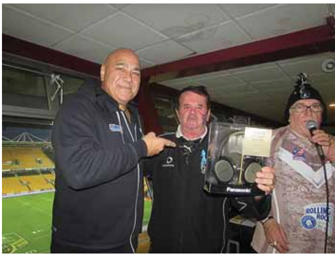
The music man, Elvis, gets his award.