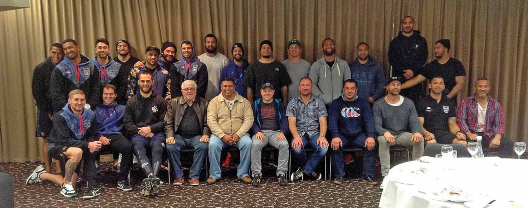
I took the Vodafone Warriors team to play the Titans out for lunch on Saturday, along with a few of the old boys. We had a blast.