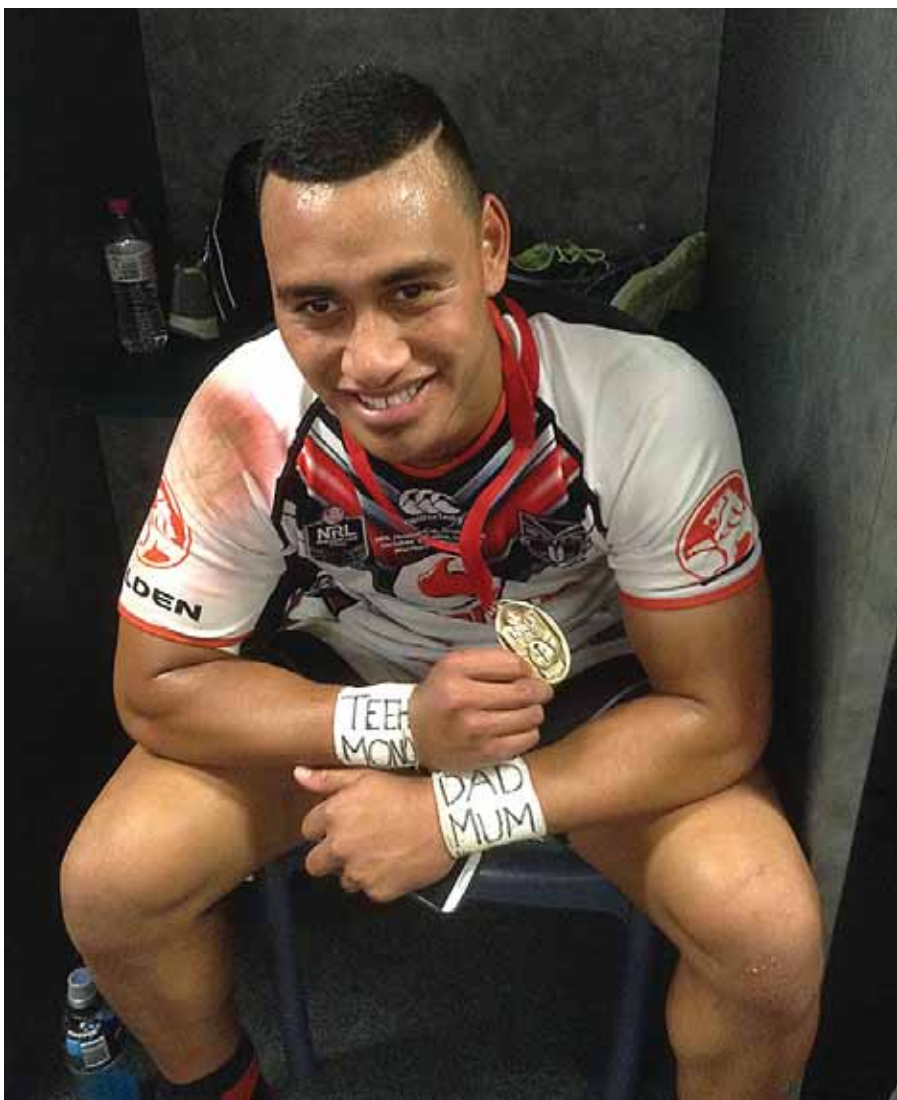
I love you, Mum and Dad. What a lovely message to wear on game day.