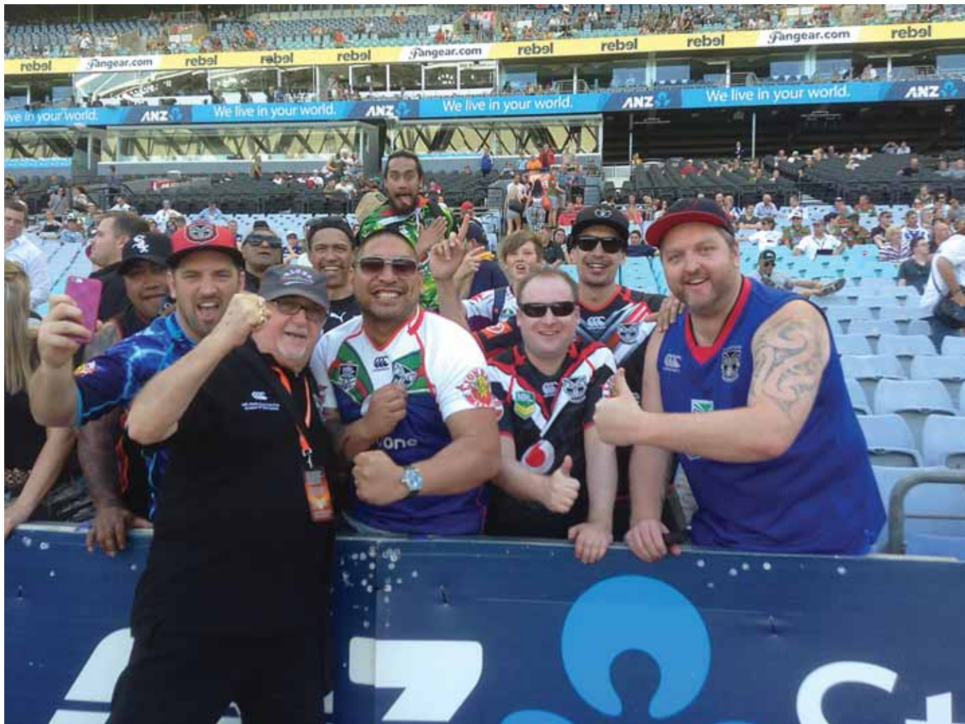
Where would we be without the fans? These are the die-hard fans.