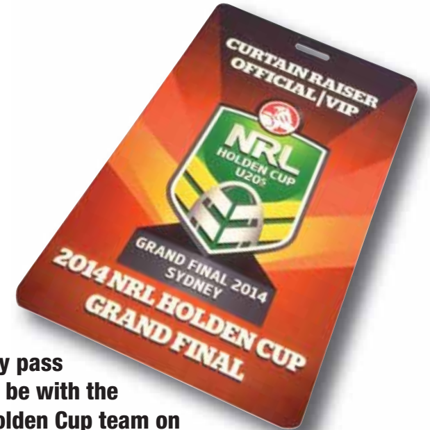
My pass to be with the Holden Cup team on Grand Final day.