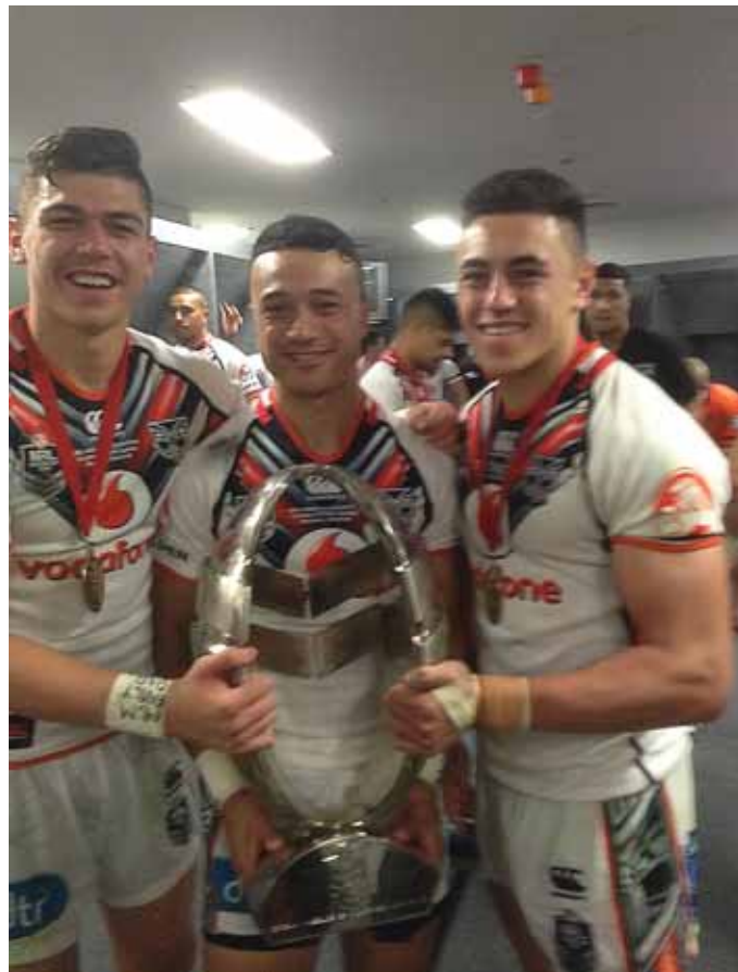
The Three Musketeers share the trophy!