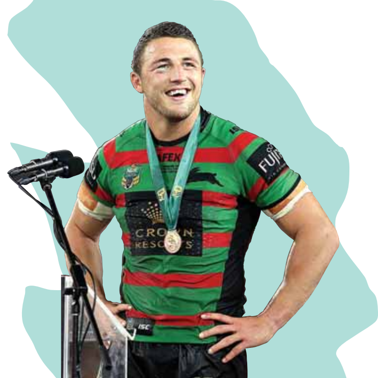
Sam Burgess, the Clive Churchill Medallist. NRL Grand Final - Rabbitohs v Bulldogs. ANZ Stadium, Sydney Australia. Sunday 5 October 2014.

Burgess will have no shortage of relevant help in changing codes. Bath's coach Mike Ford is a former convert while England have Andy Farrell in their coaching ranks – someone very familiar with how tough the transition can be. Despite this type of help at his disposal, history shows Sam Burgess is unlikely to be a dominant force at next year's Rugby World Cup. If he can be though, it would be even more astonishing than the heroic effort he turned in during Souths' 30-6 crushing victory over the Bulldogs at the weekend.