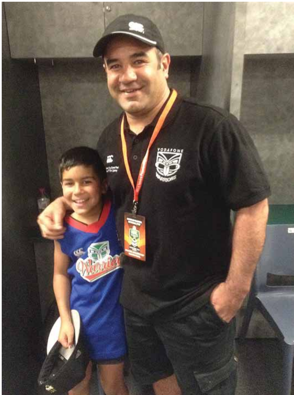
Dad and son enjoy the moment. Now that's GOLD!