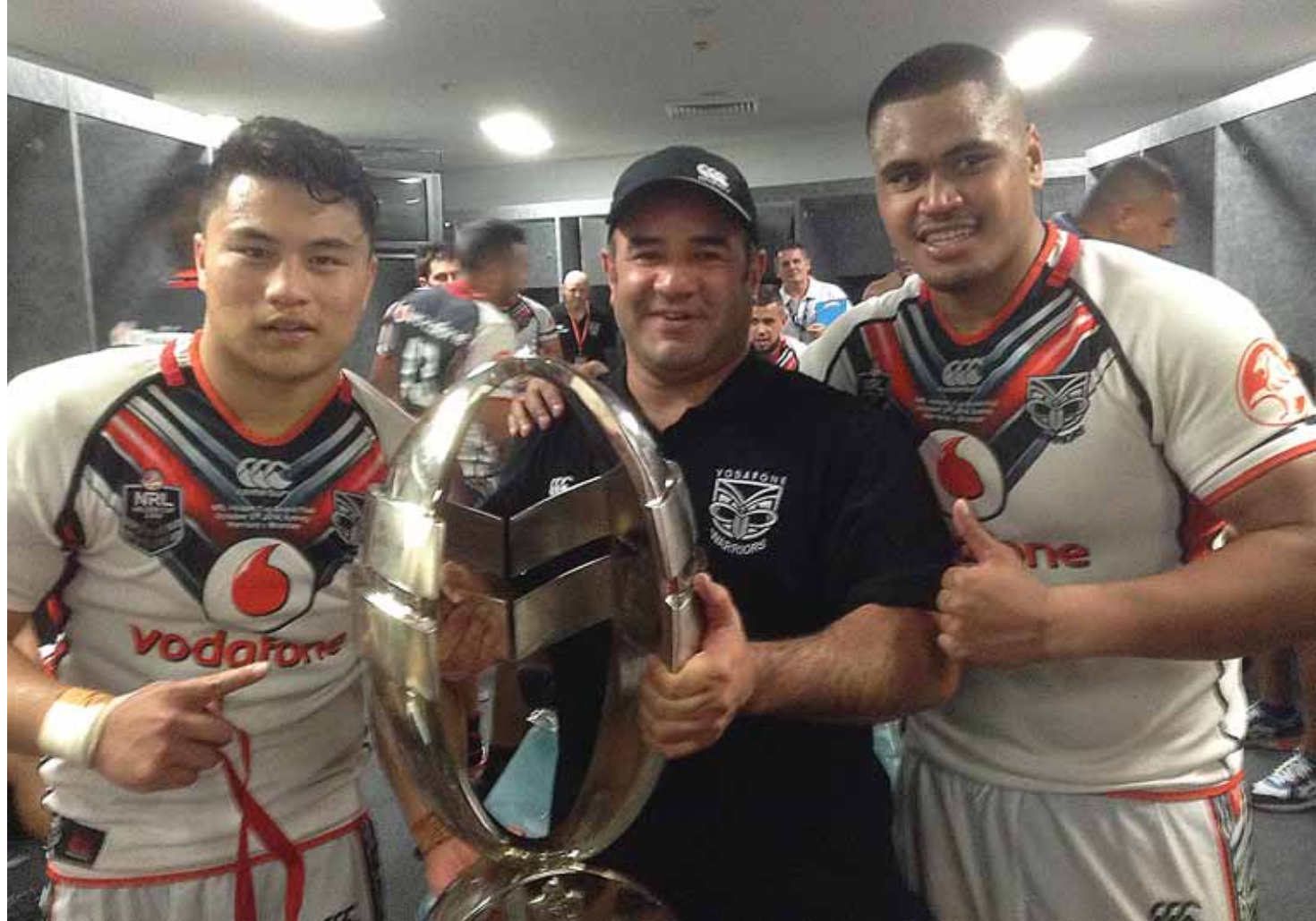
The co-captains share the trophy with the coach. Lovely stuff!