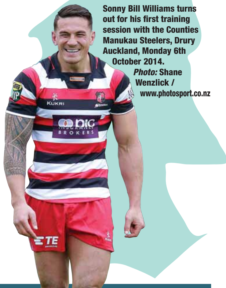
Sonny Bill Williams turns out for his first training session with the Counties Manukau Steelers, Drury Auckland, Monday 6th October 2014.