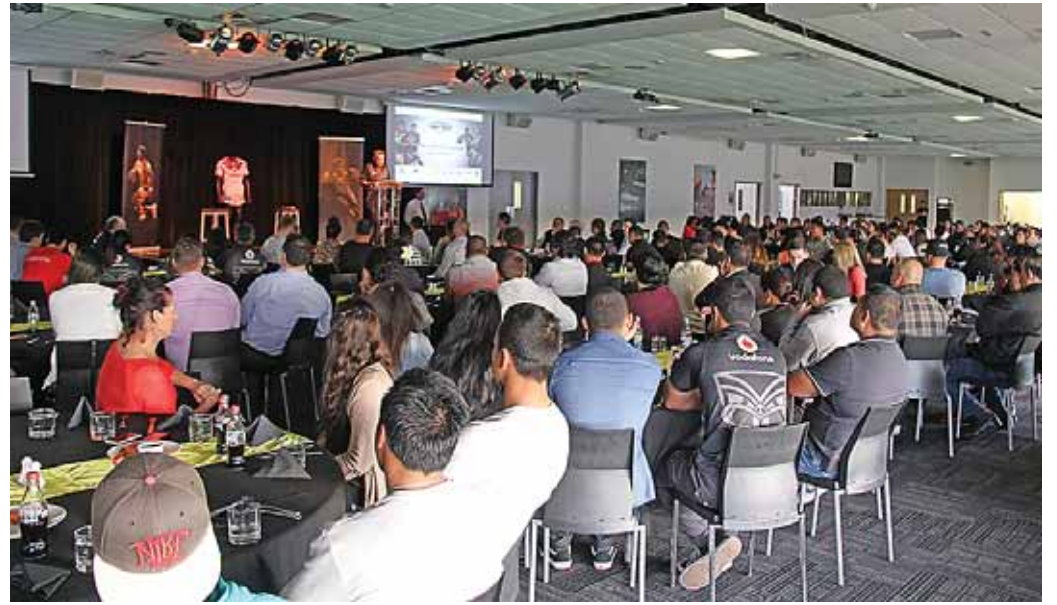
The crowd at Family Night.