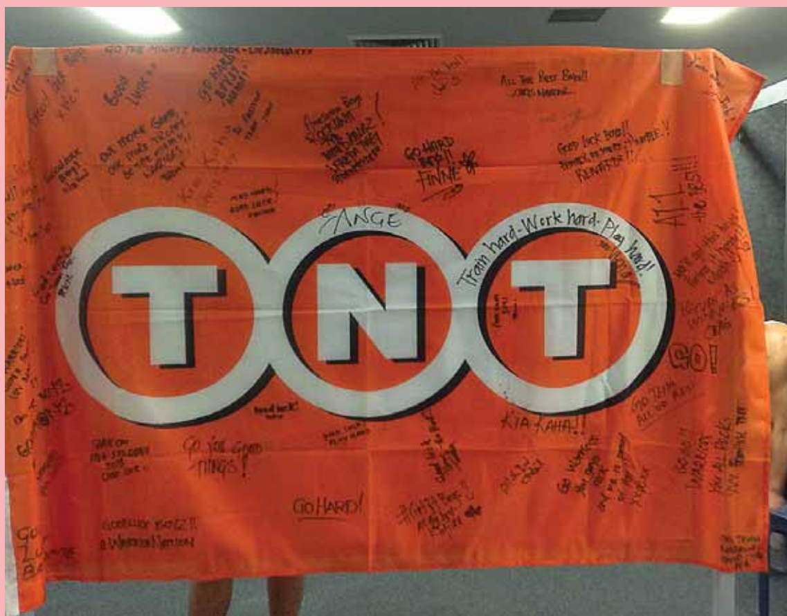
The NYC boys loved this signed flag from TNT. Well done, TNT!