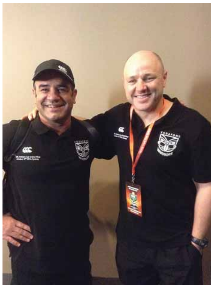
Nice to see Vodafone Warriors head coach, Andrew McFadden, at the grand final supporting Stacey Jones and the boys.