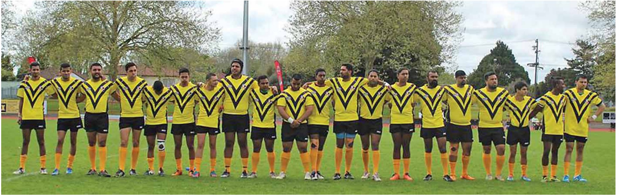
WASPS LINE UP