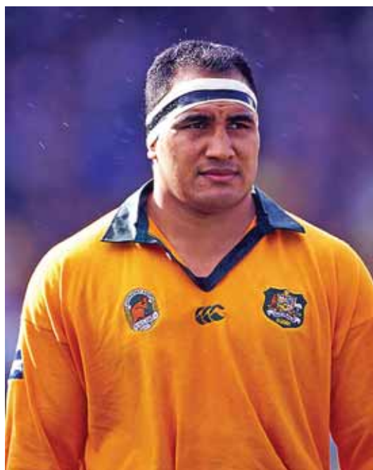
Willie Ofahengaue of Australia before the rugby match against the All Blacks, 1995.