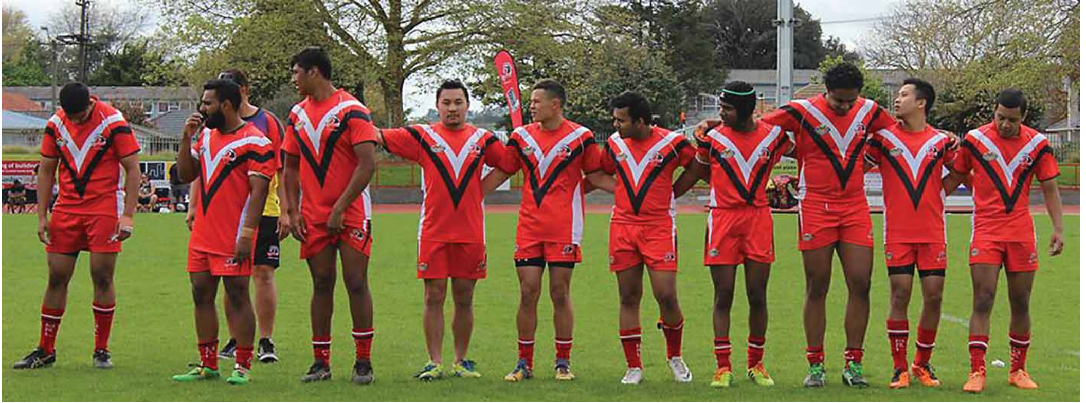
PIRANHAS LINE UP