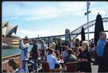
LEGENDS OF LEAGUE HARBOUR CRUISE