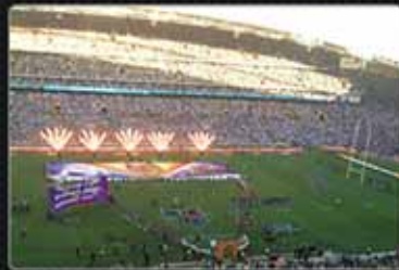
NRL GRAND FINAL 2 NIGHT PACKAGE