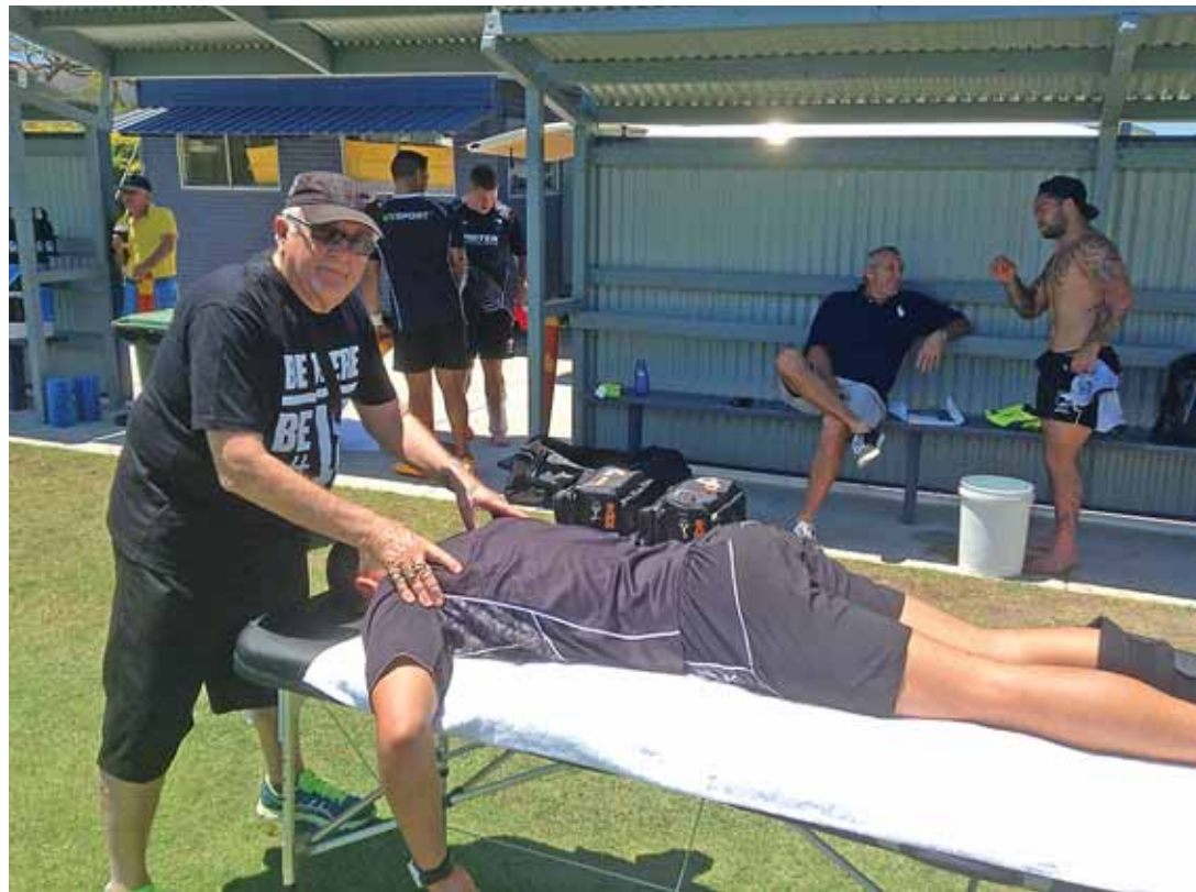
I help out with a bit of massaging at training... HAHA! ONLY JOKING!!