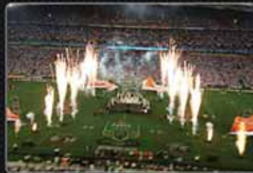
GRAND FINAL 4 NIGHT ULTIMATE TOUR