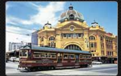
FULL MONTY TOUR FOR UK FANS

http://www.therugbyleagueexperience.com.au/world-club-series-tour/2015-world-club-series-tour/