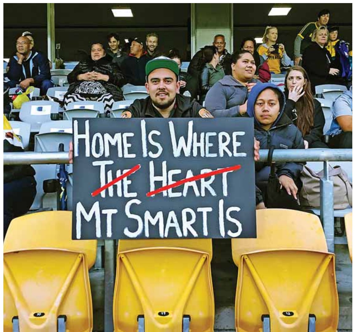
The winning banner at Mt Smart on Saturday.

Unfortunately, the weather killed it for the fans of the Junior Kiwis, but the real die-hard fans turned up fully kitted out and I loved some of the banners they made for the game. Good on yer, guys!