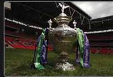
UK CHALLENGE CUP TOUR