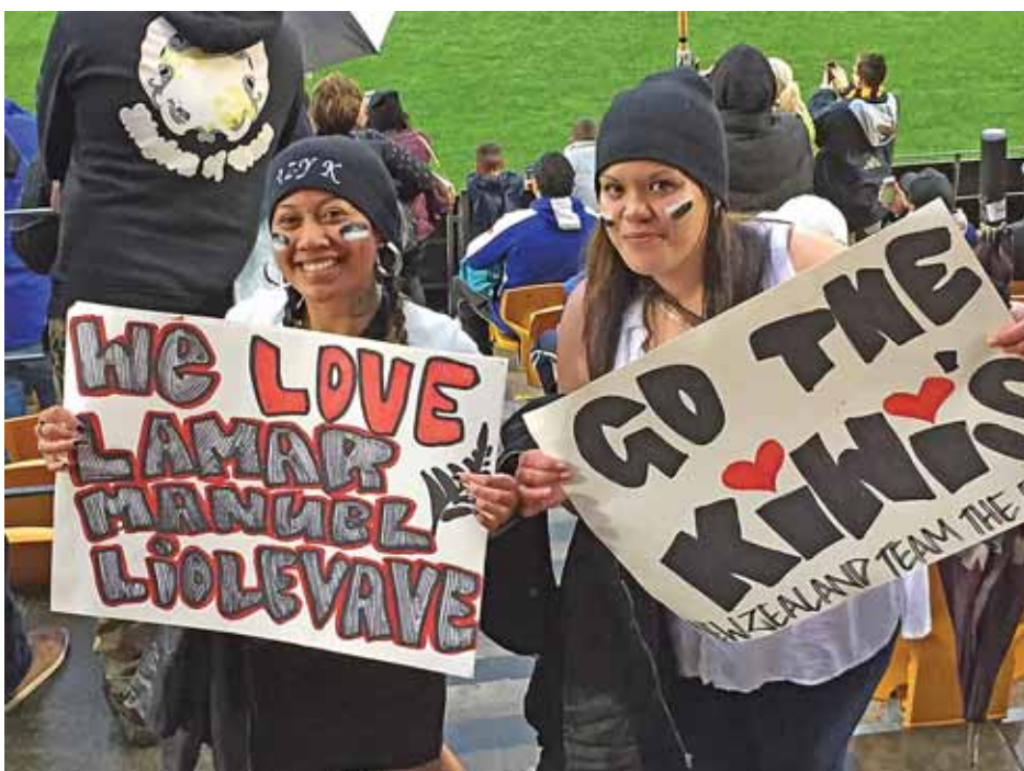
A couple more signs from Saturday's game.